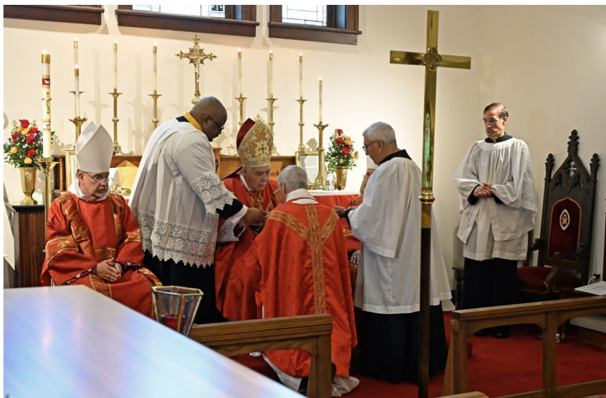
he is handed the Bible, the Ring is placed on his ring finger,