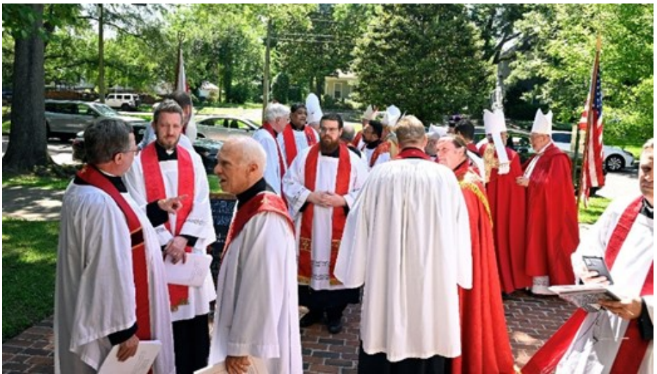
The Clergy gather outside the Cathedral prior to the Consecration