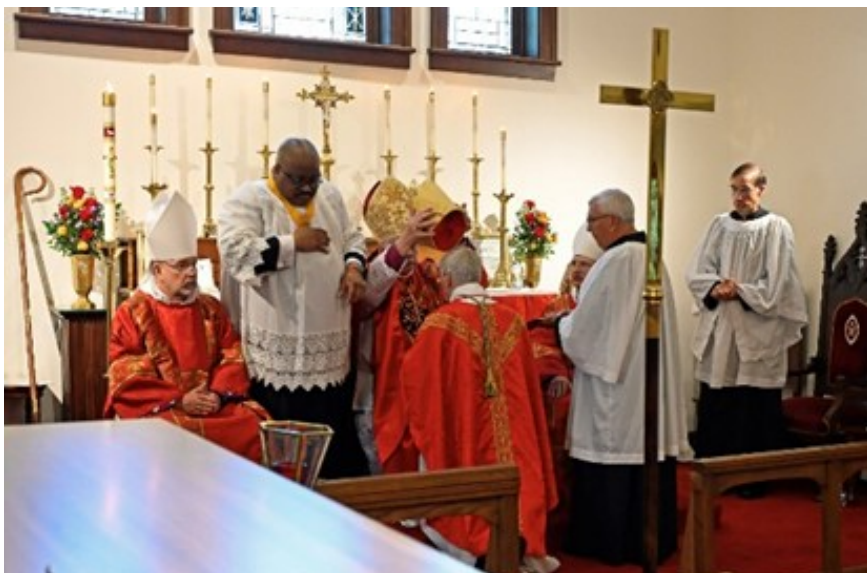
the Pectoral Cross is placed around his neck and the Mitre on his head.