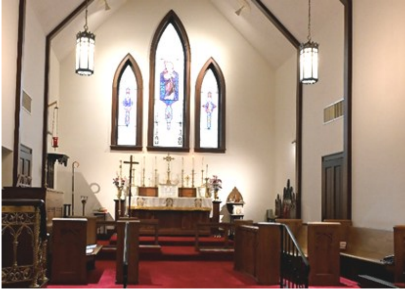
Interior of St George's Cathedral