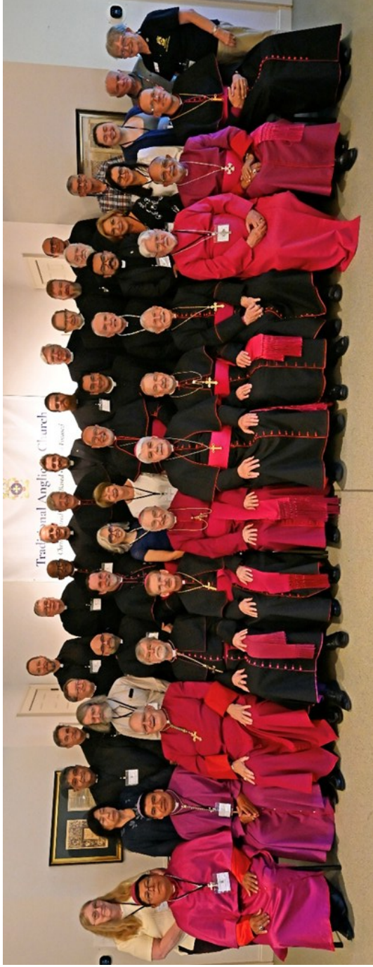
Clergy and laity who were in attendance at the first General Synod