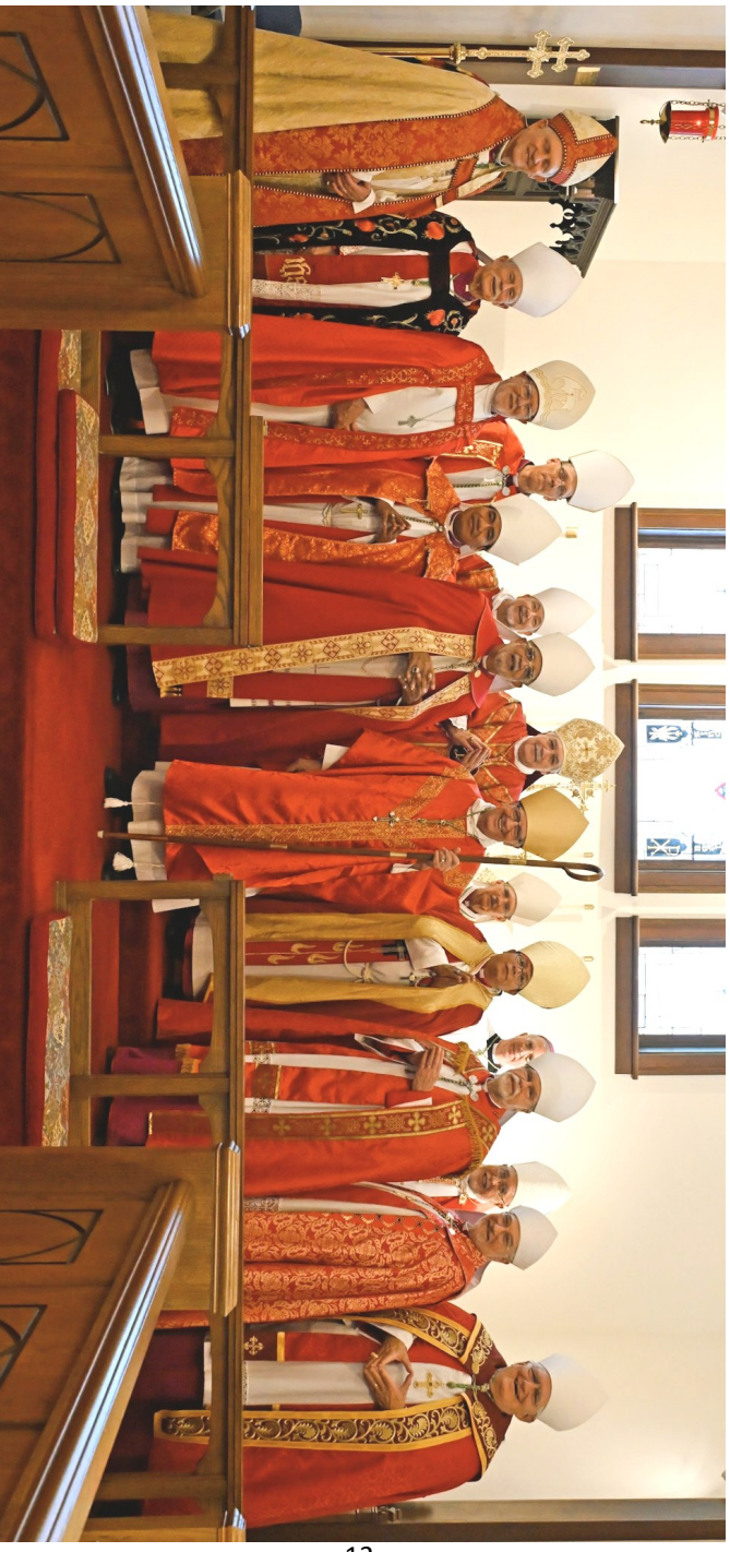
The Bishops of the Traditional Anglican Church who were present at the Consecration