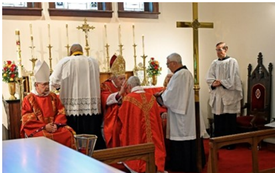
After Consecration, he is anointed by the Primate,