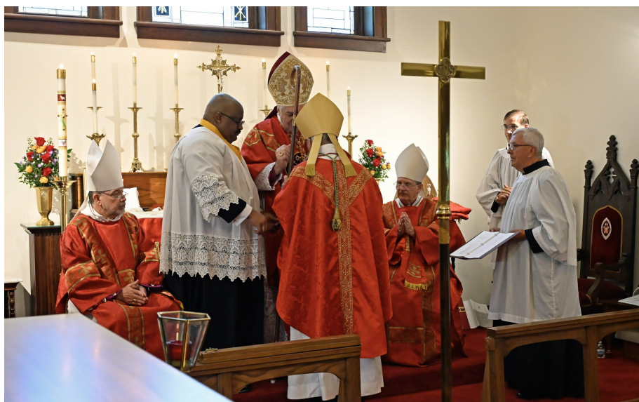
He is given the Pastoral Staff.