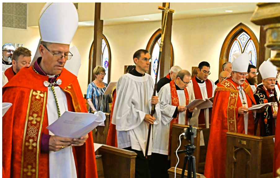
The procession enters the Cathedral