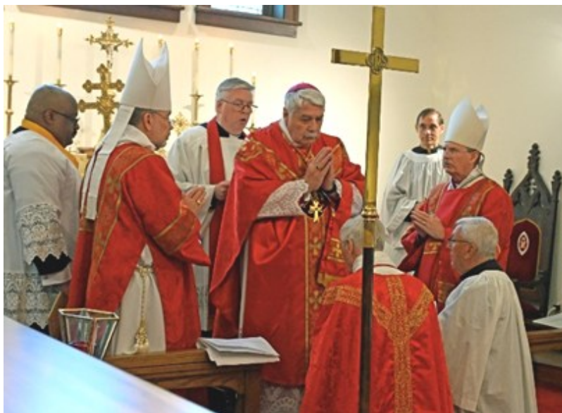
He is vested in his chasuble