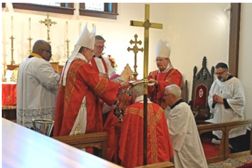
The open Book of the Gospels is placed upon his head