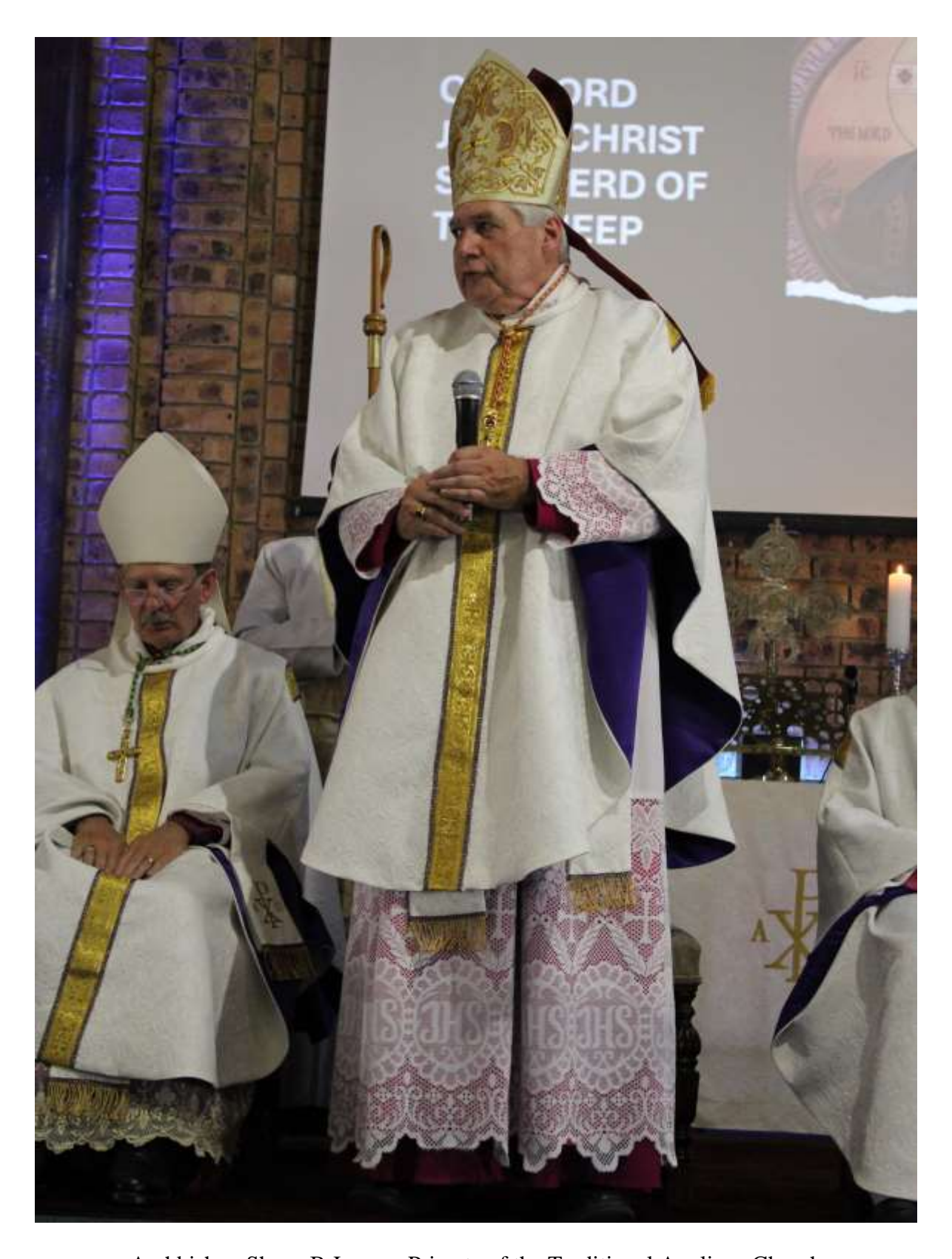
Archbishop Shane B Janzen, Primate of the Traditional Anglican Church