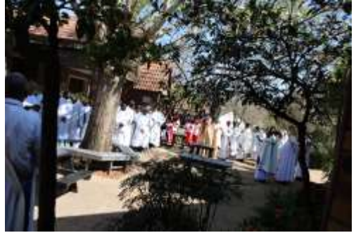
The Prayers of Preparation