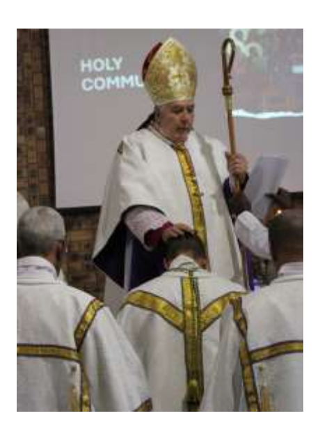
SOME OTHER PICTURES