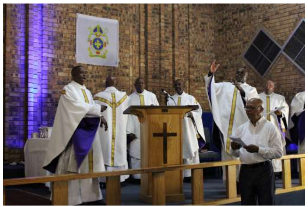
The Regional Deans rejoice!