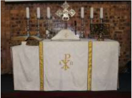
"I will go unto the Altar of God"