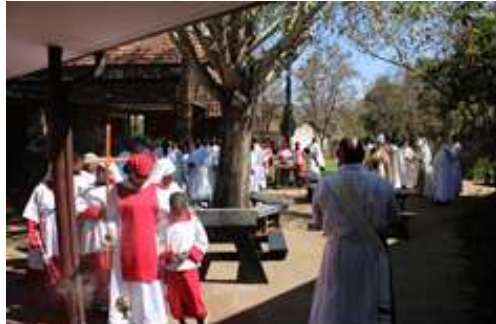
The Procession enters the church