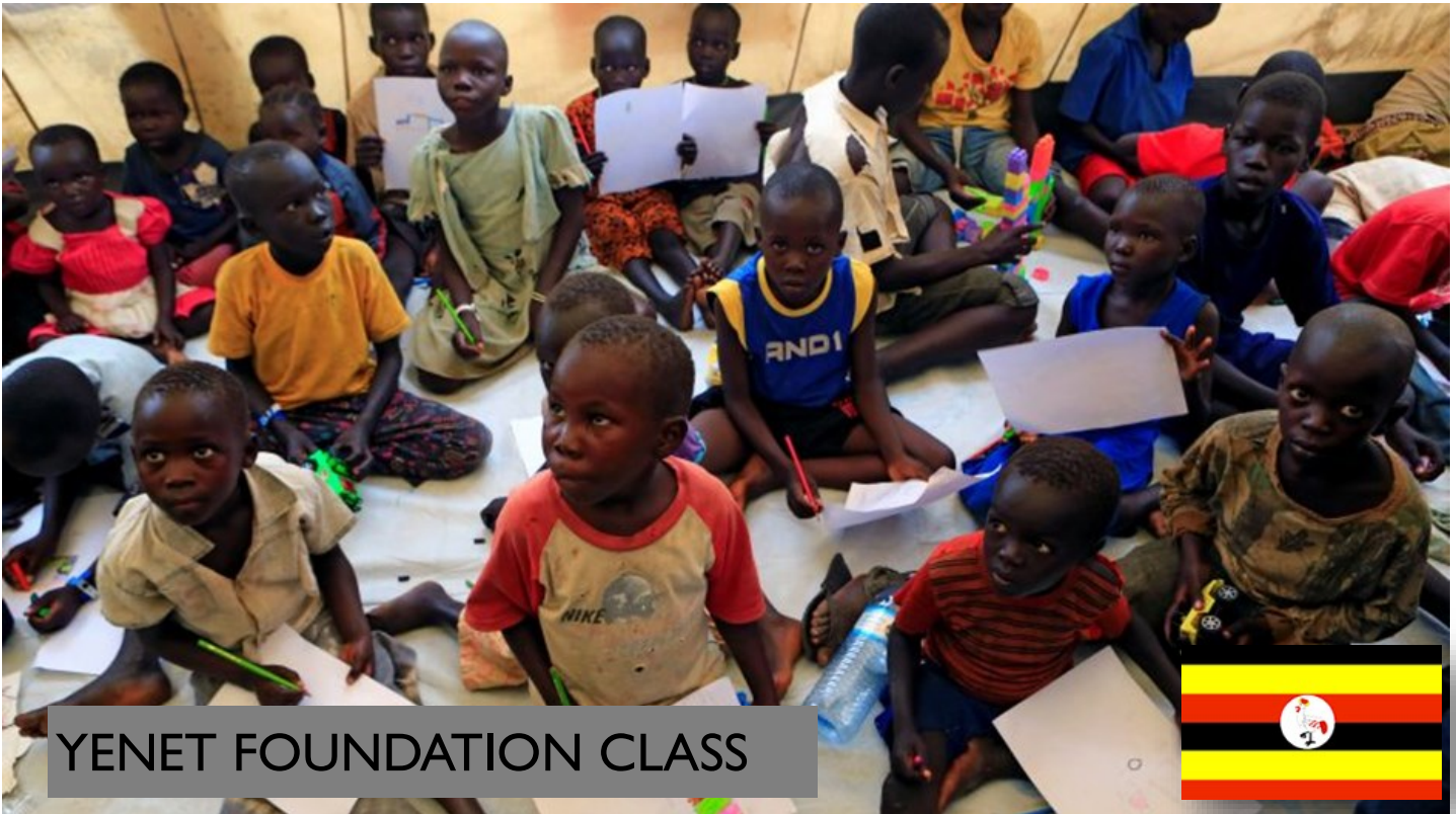
YENET FOUNDATION CLASS