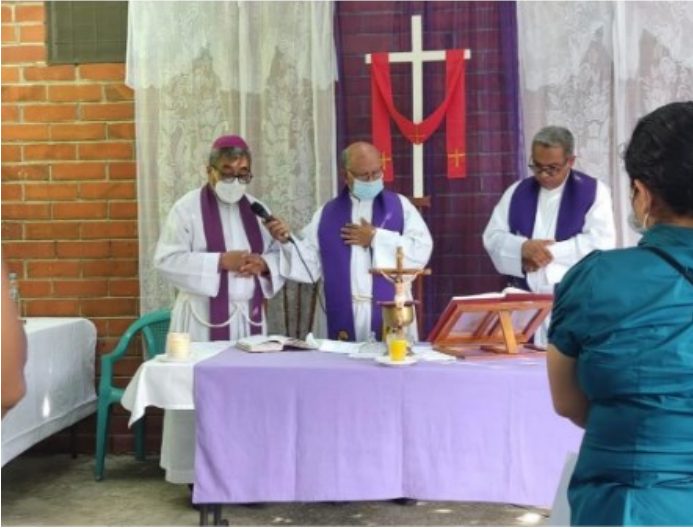
Holy Eucharist of Synod in October 2023 at Quezltepeque, San Salvador