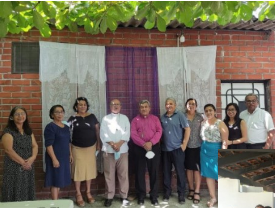
Spiritual Mission Retreat at Enero, San Salvador 2023