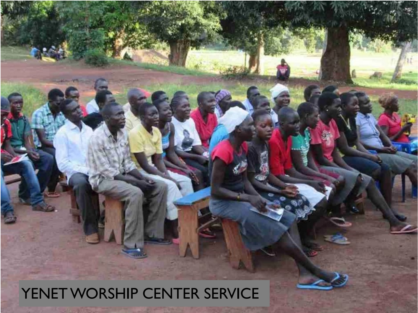
YENET WORSHIP CENTER SERVICE