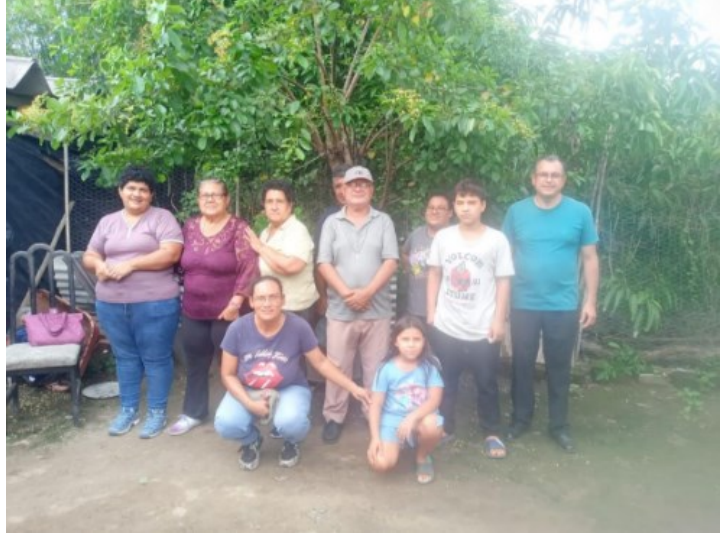
Members at Synod