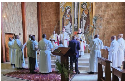
Renewal of Priestly Vows before the Altar

The Blessing of the Holy Oils and Renewal of Priestly Vows is one of the most profound events of the Christian Year and takes place on Maundy Thursday Morning. Holy Oil is used by every clergyman in the anointing of the sick and of the dying. Holy Oils are also used at Baptism, Confirmation and Ordination. Each clergyman is supplied with the Oil of Unction to support his pastoral work, and each parish has Oil of Chrism for use at Baptisms and other blessings. The service was held at Holy Cross, Pretoria, and was well attended by the clergy of the Gauteng Region. At this service the appointments of Canons and the Vicar General were announced.