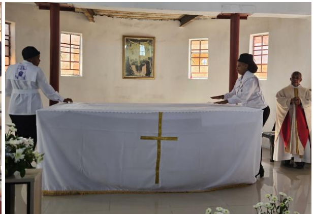
Dressing the Altar after it has been consecrated