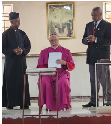
The Bishop explains the Canons