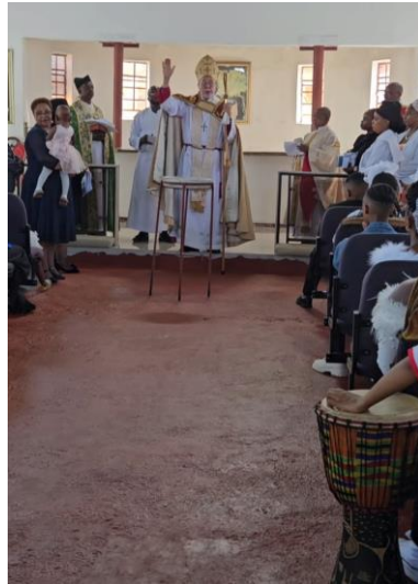
Blessing the Font