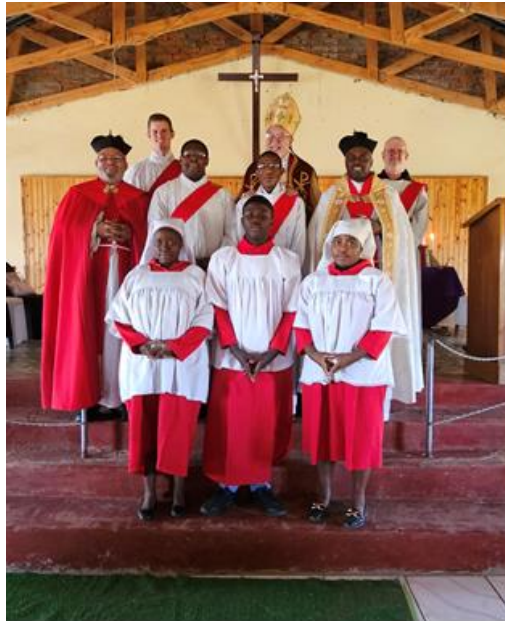
The excellent Servers