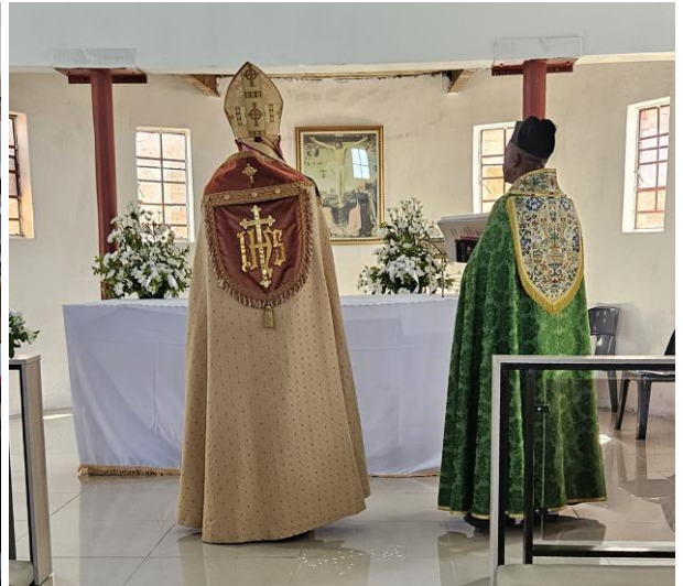
Blessing the beautiful Altar