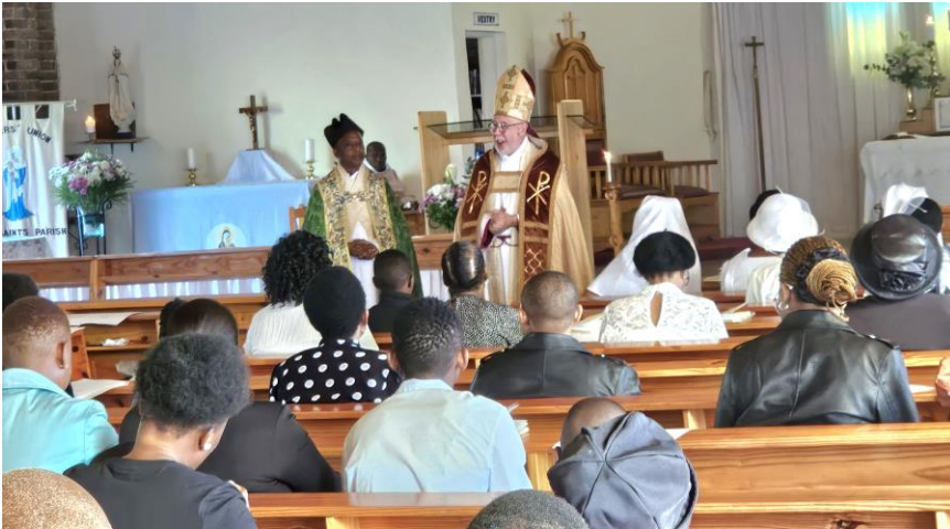
The Bishop spoke to the people about recent developments in the TAC.