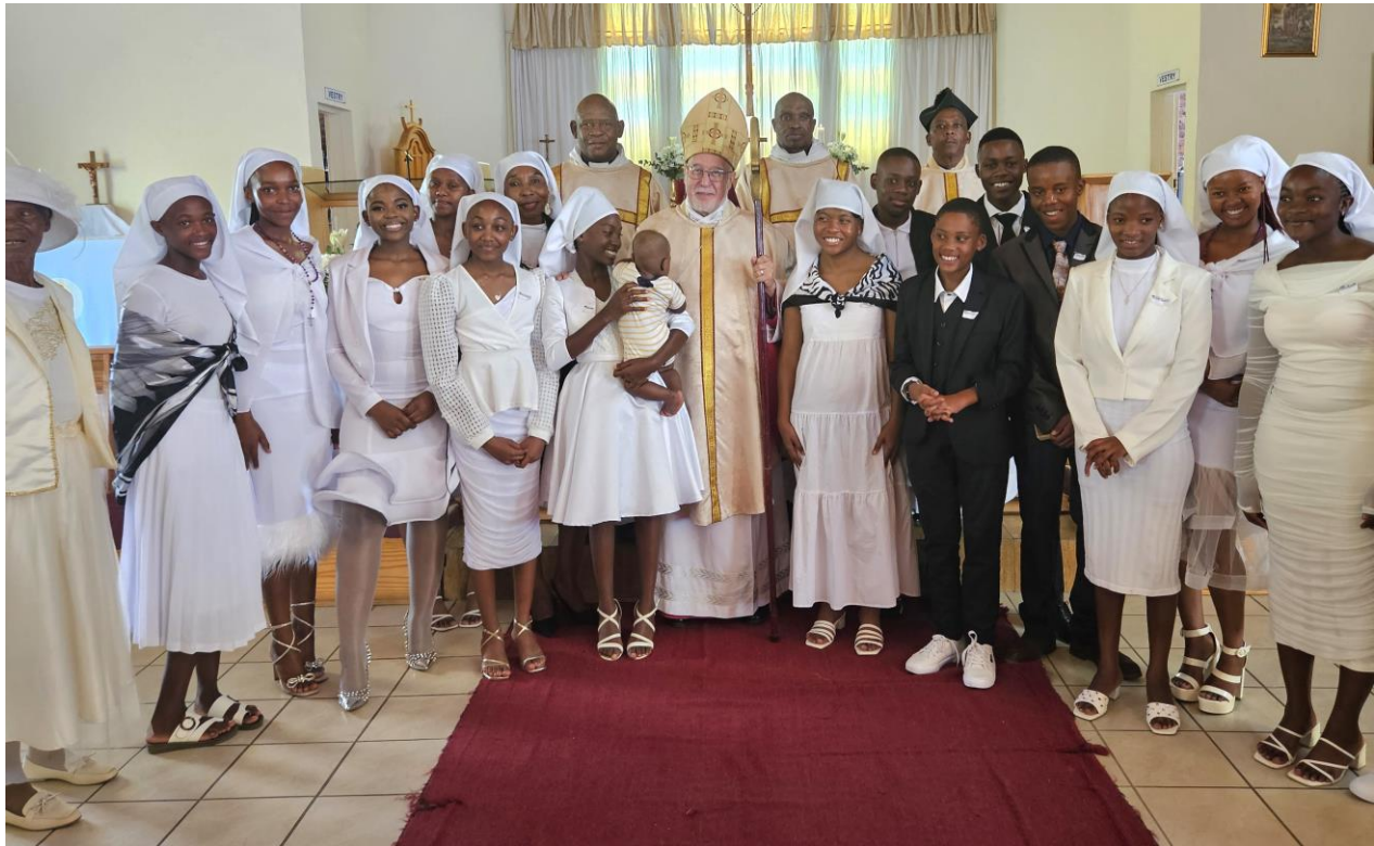
Those who were Confirmed at All Saints, Seshego – May our Lord richly bless their lives!