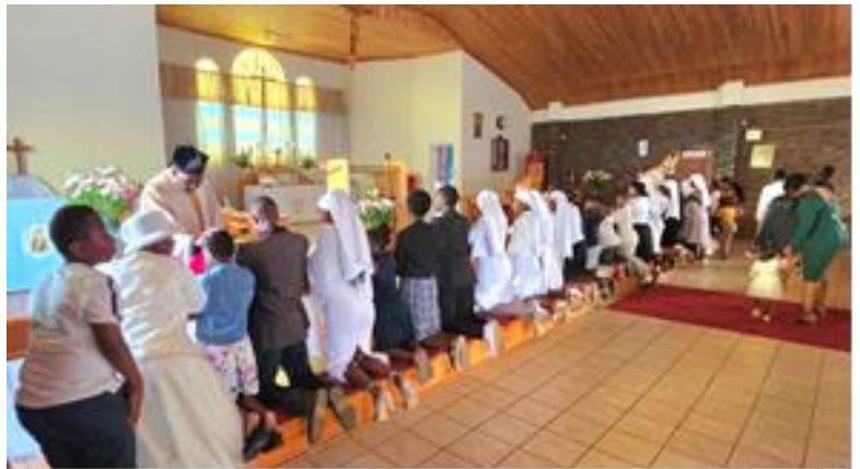
The wonderful, sacred moment of First Holy Communion