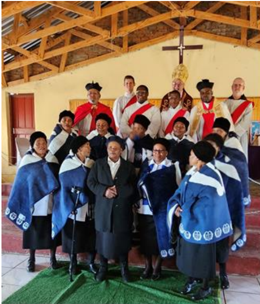
The faithful Mothers Union members