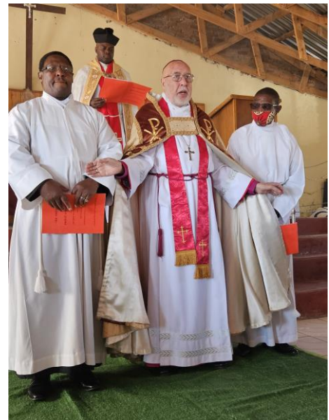
The men for Ordination are introduced by the Bishop