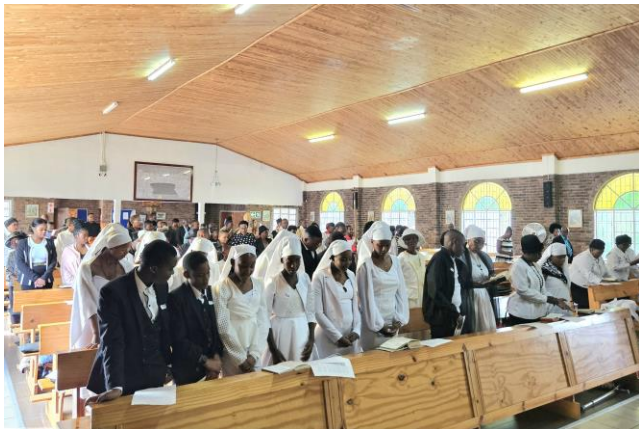
The Candidates profess their Faith as Christians