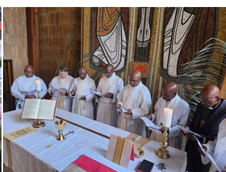
Gathering for the Blessing of the Holy Oils