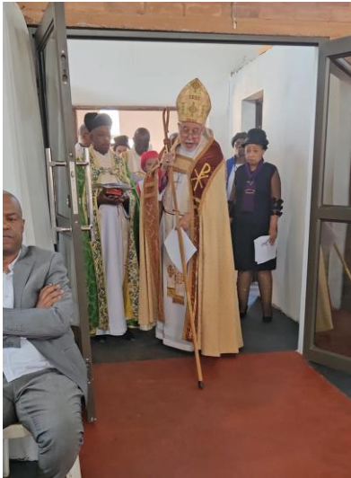
Blessing the entrance to the church