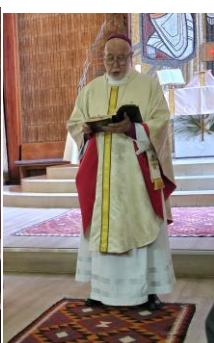
The Bishop's exhortation