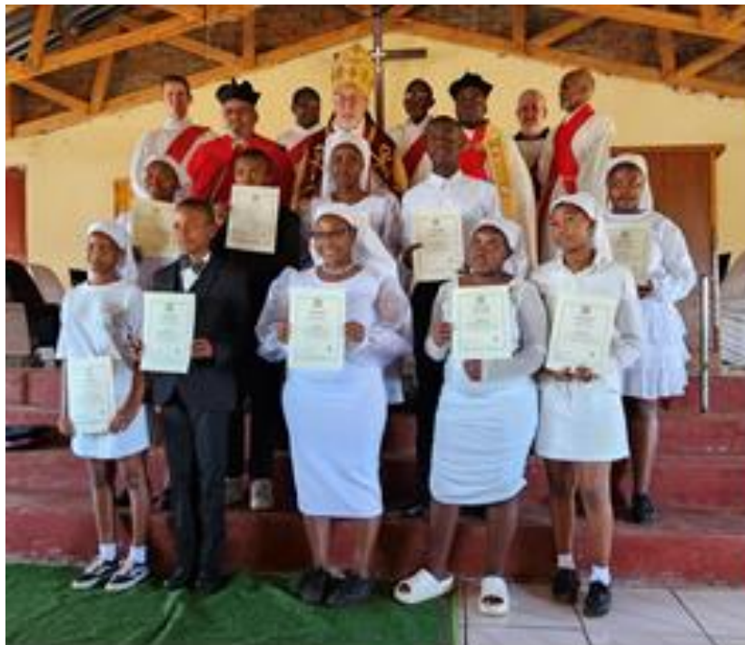
This was a joyous event for all concerned, and there was much enthusiasm amongst the people of the congregation