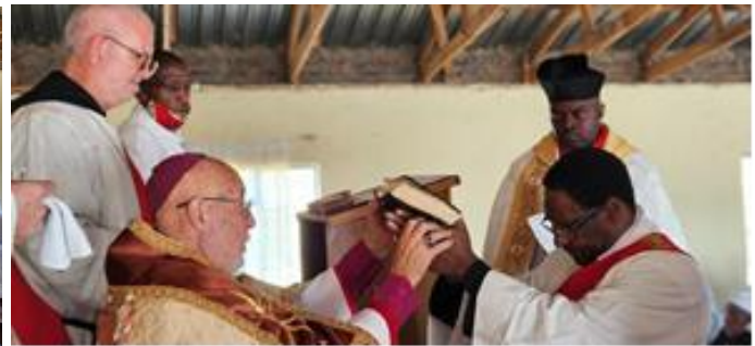
The newly-Ordained Deacons are presented with the Holy Scriptures