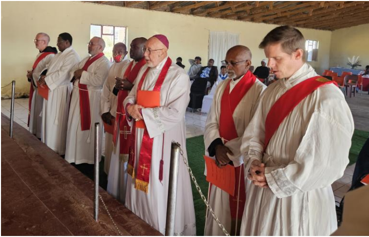
The Prayers of Preparation