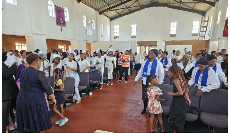
The large and exuberant congregation enjoying a hymn