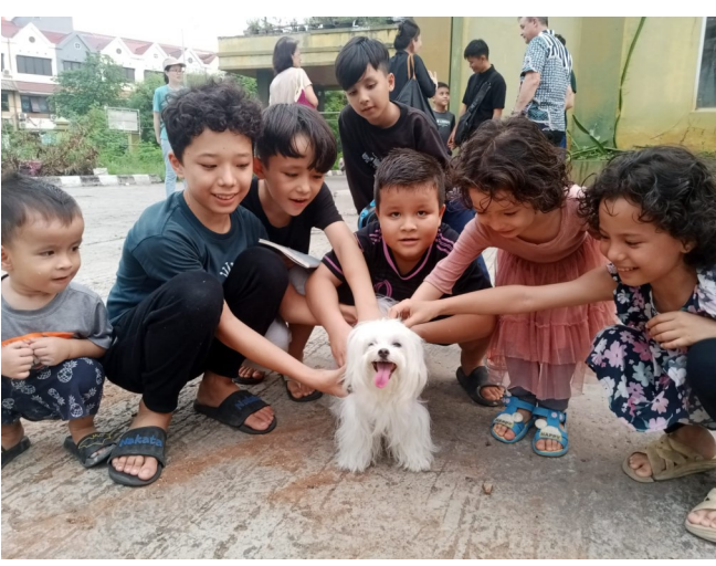
Our old dog Tini visited the refugee camp with her new owner to the delight of the children.