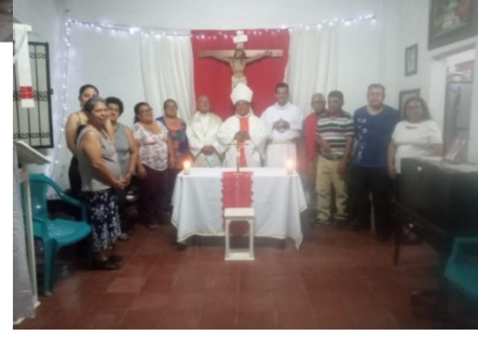
Spiritual Mission Retreat at Santa Cruz, San Salvador