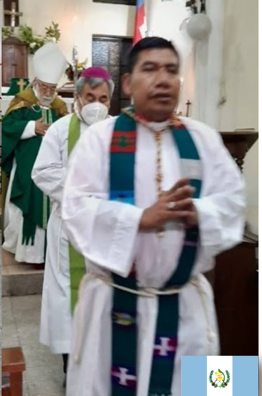
The Holy Eucharist during the 33rd Synod of the Anglican Diocese of Central America. Election of the new Bishop Coadjutor. Sunday November 21, 2021