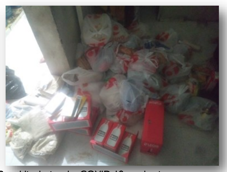
Food package distribution in the Dominican Republic during the COVID 19 pandemic