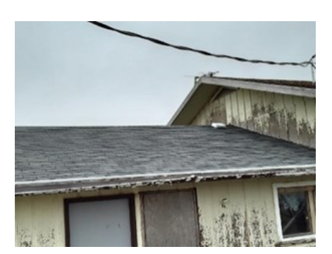
New roof work partially funded by the IAF