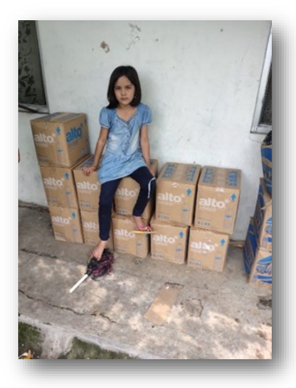
Drinking water for the Kalideres camp which houses particularly destitute people