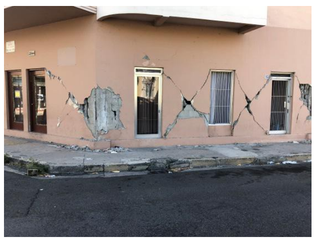
More earthquake damage to buildings in Puerto Rico.