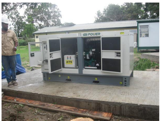
The new 60KVA generator in Lusaka, Zambia