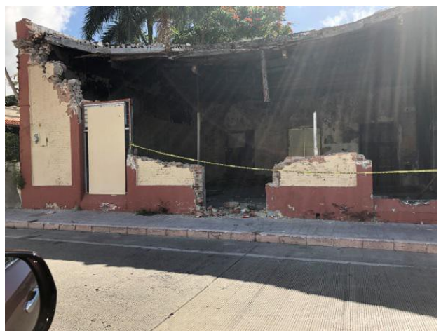
Earthquake damage to buildings in Puerto Rico.

Beginning in December 2019, several hundred earthquakes began hitting the southwestern part of Puerto Rico.