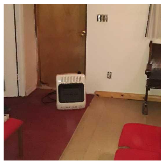
The new heater for the Mission.

Yes...it does get rather "nippy" during wintertime in South Dakota. To help thwart "Old Man Winter" and with approval of the IAF Board of Directors, the Fellowship donated $500(USD) to purchase a propane fired space heater for the mission church. It may look small and unassuming, but evidently it does the job.