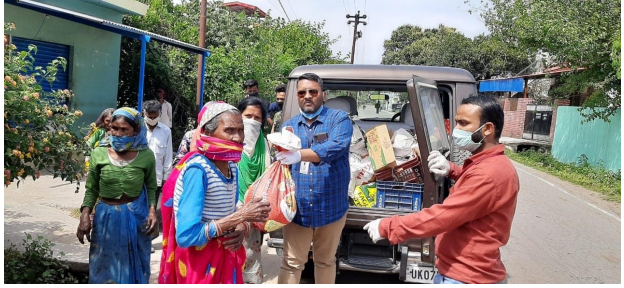
Anglican Church of India parishioners helping with food distribution.

In such times of crisis people look up to religious leaders for prayers and word of support for that we arranged "prayer from home" program where anybody can join this prayer program. We have told with our parish priests to help the needy and distribute food to poor people, labour class people and anyone who needs any help as the small businesses and daily wage workers are worst hit and they cannot buy food for their family and soon another problem might arise where people would be dying of hunger.