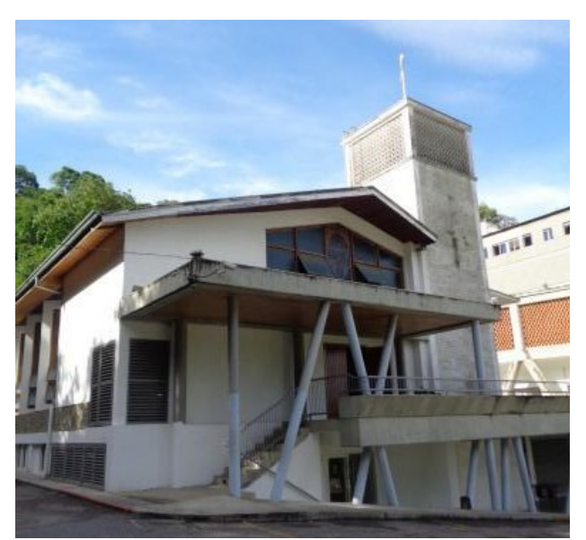
St. Mary's Anglican Church, Caracas, Venezuela

For the second time, the IAF, and members of the Diocese of the West (Anglican Church in America) joined forces to help provide a little relief to our brothers and sisters at St. Mary's Anglican Church in the beleaguered country of Venezuela. A 300 pound shipment of non-perishable foodstuffs was sent to Caracas. Over the last several months, four shipments have made it to the folks at St. Mary's.