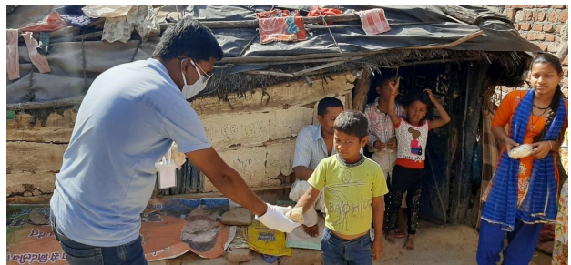
Distributing food to the needy.

understand the severity of the spread of this virus. The social distancing seems to be working for now in India but there have been cases where people have not been adhering to the rule where new cluster of cases are emerging and they are spreading disease to other people. India doesn't have resources with which to fight this disease as we have shortages of medical staff, for example, there is 1 doctor to 11,000 people, approximately, and if the situation rises further, the results will be dire.