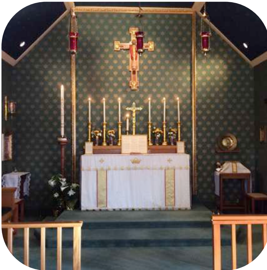
Easter 2018 at the Cathedral

The Clergy and Laity of the Cathedral Church continue to support with their time, talent, and treasure the Anglican Catholic Church of Canada, the Traditional Anglican Communion, and the International Anglican Fellowship. We may be small in number but we are big in faith, fellowship and Christian service. May God continue to bless His Church in this Cathedral Parish with strong, faithful, and devoted clergy and people -- and by His grace may each of us continue to grow in the knowledge and love of God, and of His Son, Jesus Christ our Lord. Amen.