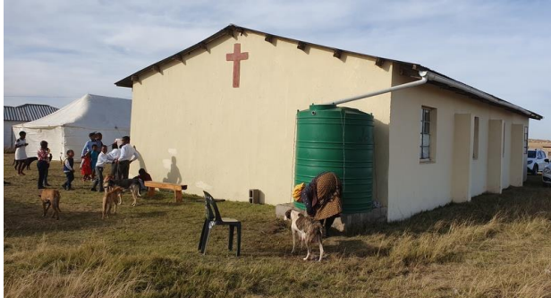
We are met by the welcoming committee