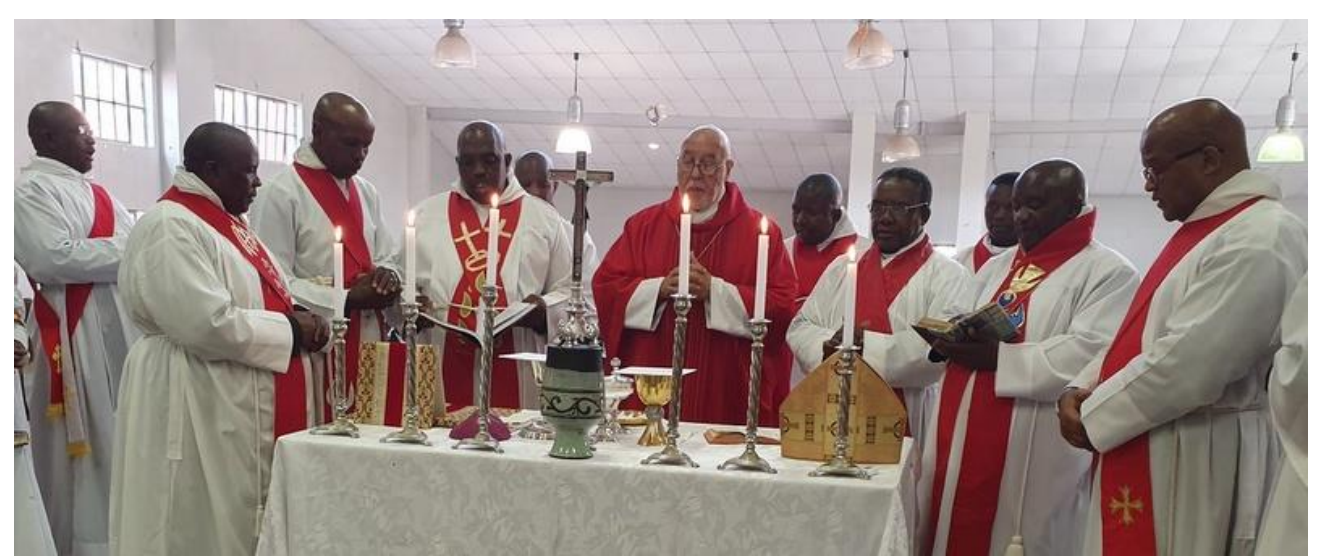
Blessed moments for the us all at the Altar of the Lord – unity, holiness and the Peace of God