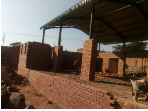
A brand new structure is emerging