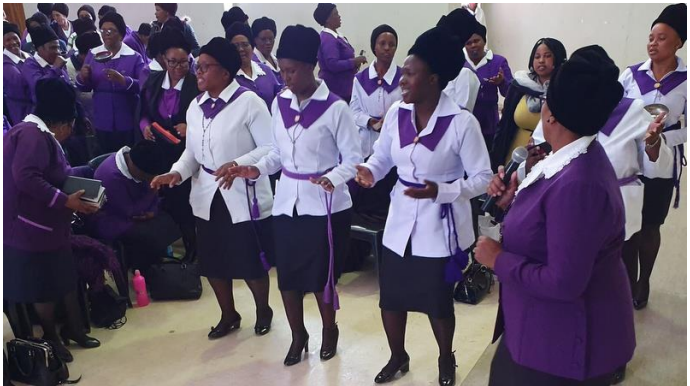
The service was a noisy affair. Much clanging of gongs and beating of drums – but high praise to God and a strong sense of achievement by all concerned. It was fulfilling to see people truly happy with their decision, feeling fulfilled and appreciated as fellow Christians – it was a day to remember!