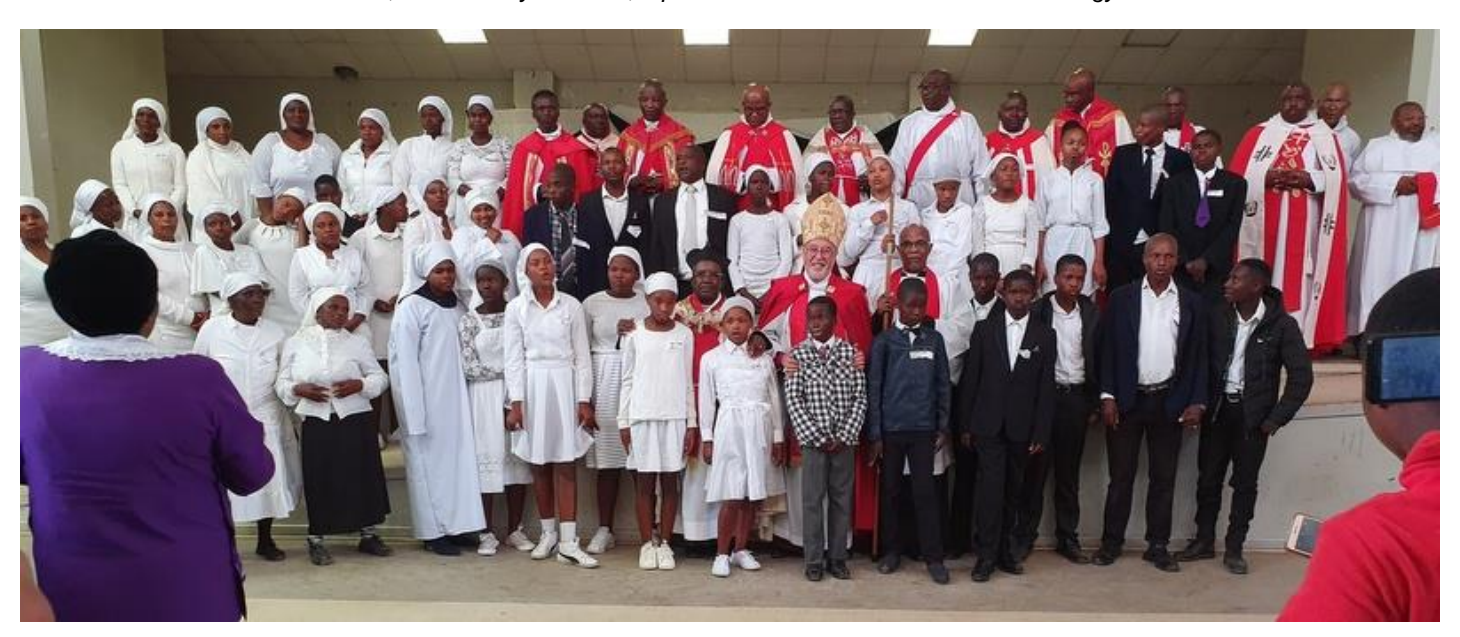
Last, but certainly not least, a picture of those Confirmed with their clergy

I would like to say a special word of thanks to the generous hearts of the people of Tsolo. We were so well received and fed...you have done your community proud!