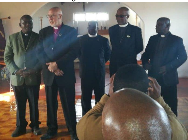
We introduce ourselves to the people of Emmanuel Parish