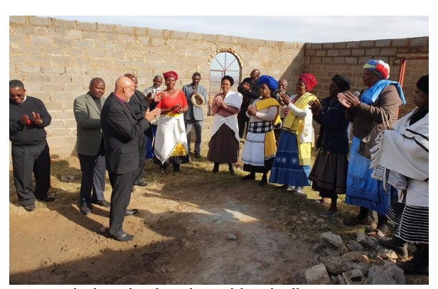
The new parish church, roof still to come .... and congratulating the hard-working ladies