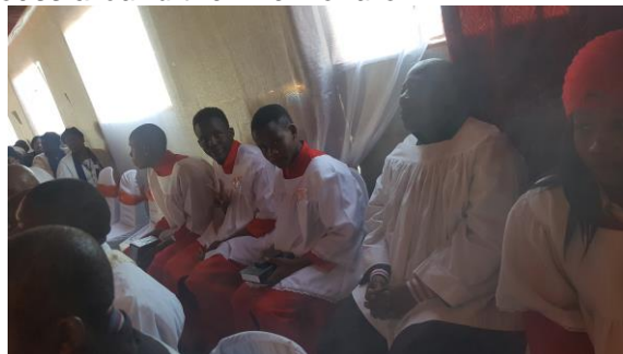
The faithful servers