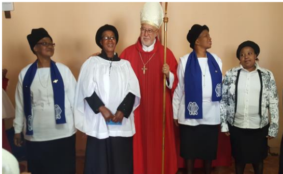
Members of the Mothers Union