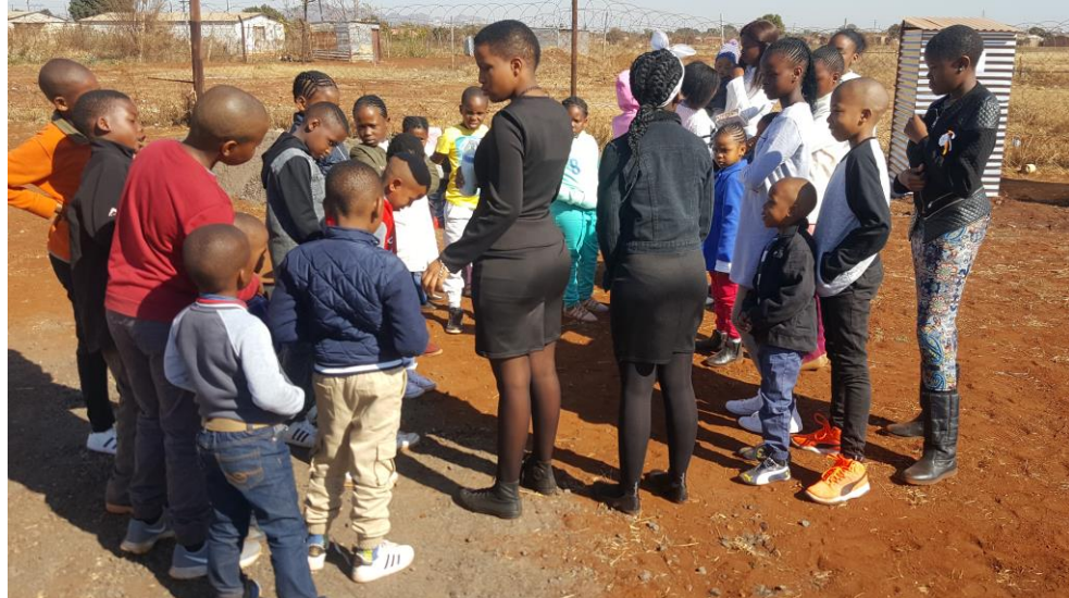
Below: The children come forward for blessing, and the women of the parish dancing and raising funds for their Building Project