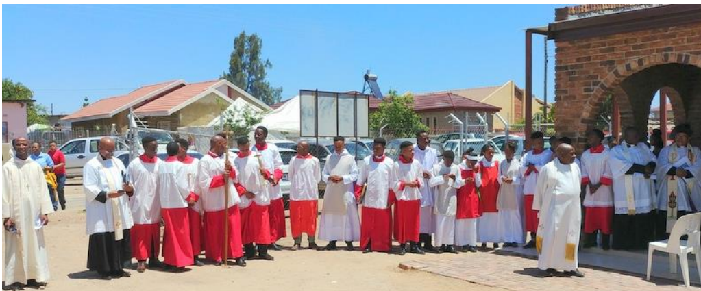
Just some of the faithful clergy and servers gathered at All Saints, Polokwane