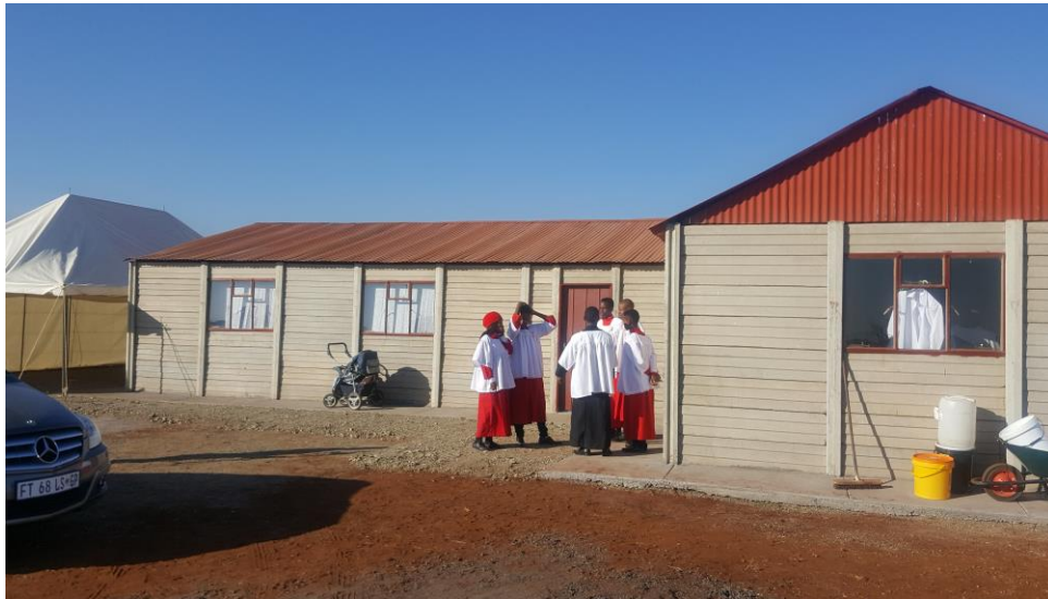
The new St Mary Magdalene, Ga Rankuwa....amazing people of the TAC!!

What followed was a joyous and very noisy service! It was a delightful occasion, and the people of God at Ga Rankuwa were filled with the Joy of the Lord.