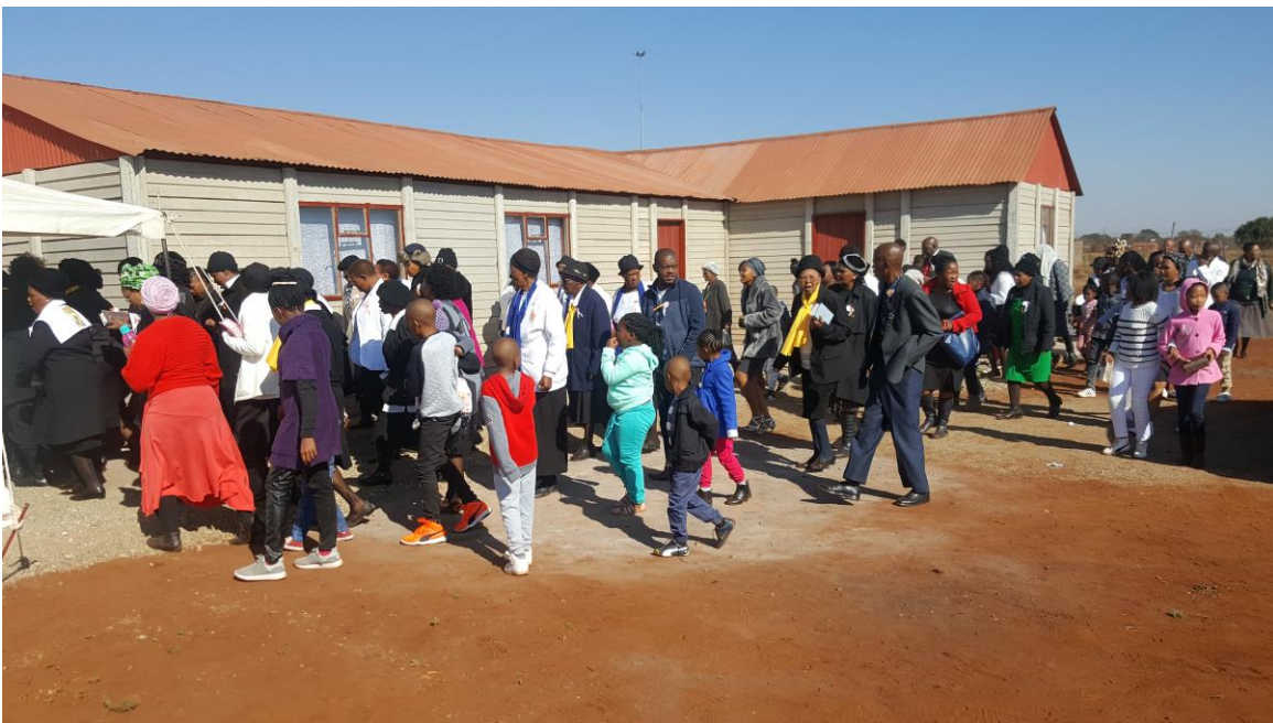
Above: The congregation process around their new church