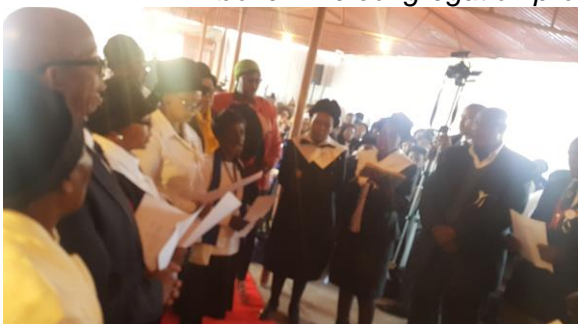
The Parish Council is admitted