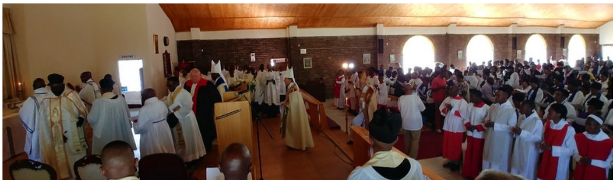
The Procession arrives at the Altar