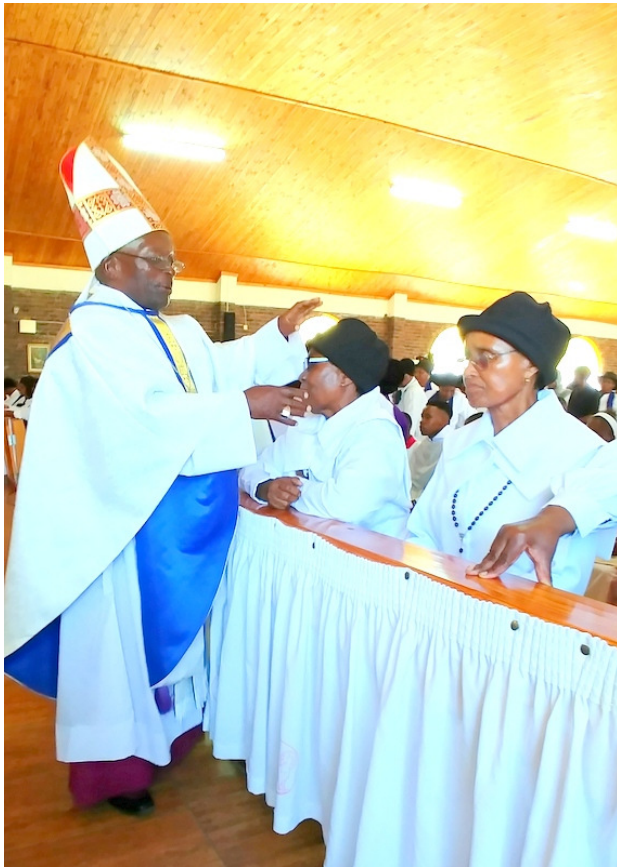
Bishop Wellington blesses the people