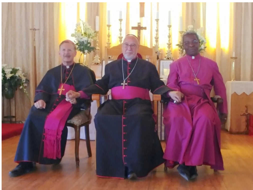
A job well done...in the sweltering heat!