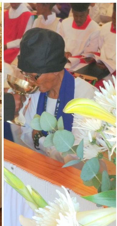
The faithful receive Holy Communion