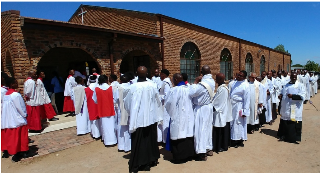
The Clergy gather outside the Pro-Cathedral for the Procession