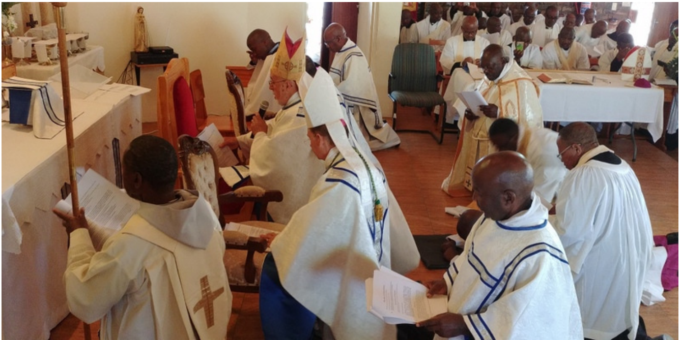
The Litany is sung while the Bishop Elect prostrates himself before the Altar