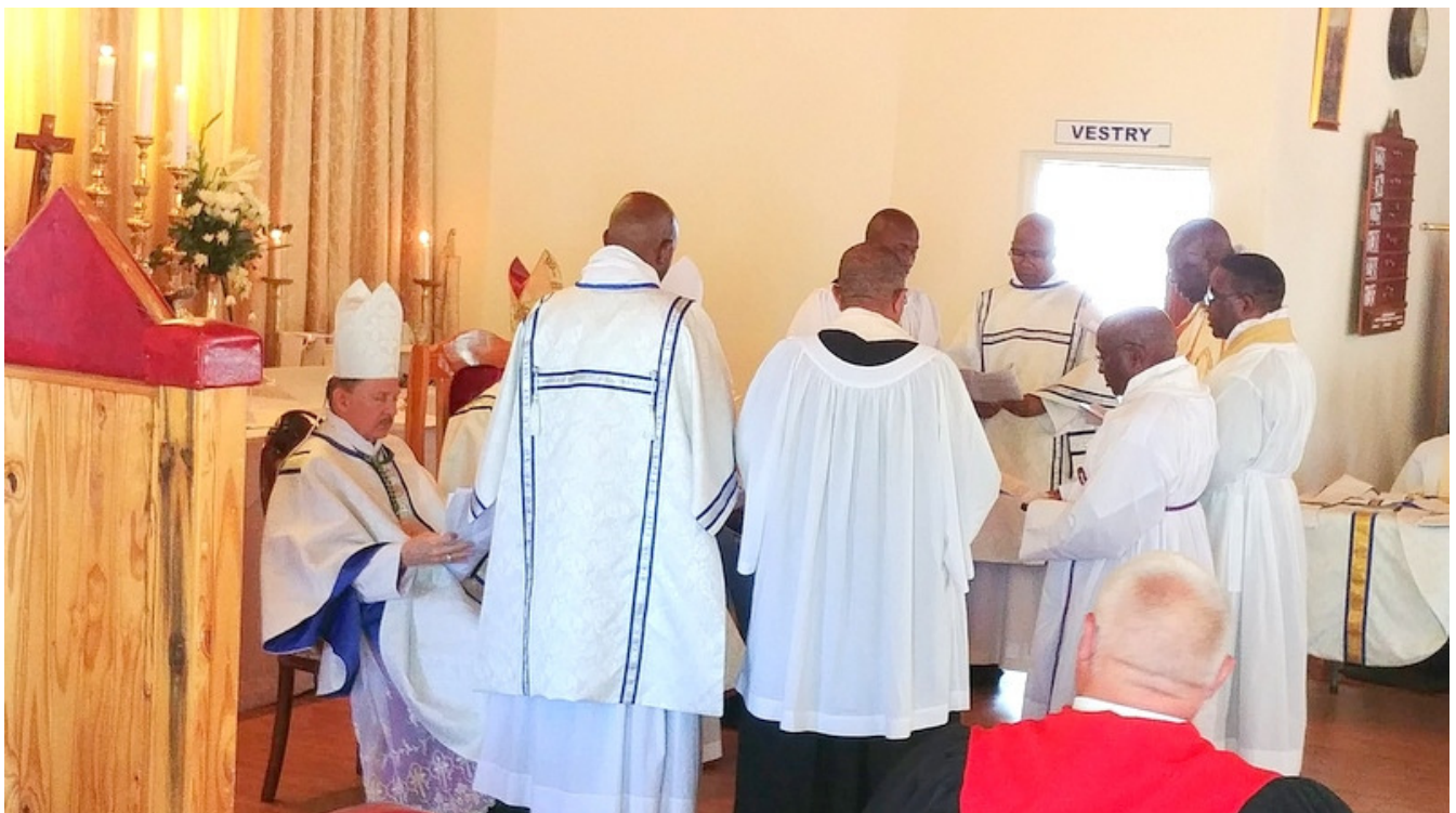
The Bishop-elect is presented to the Consecrating Bishops by the Regional Deans