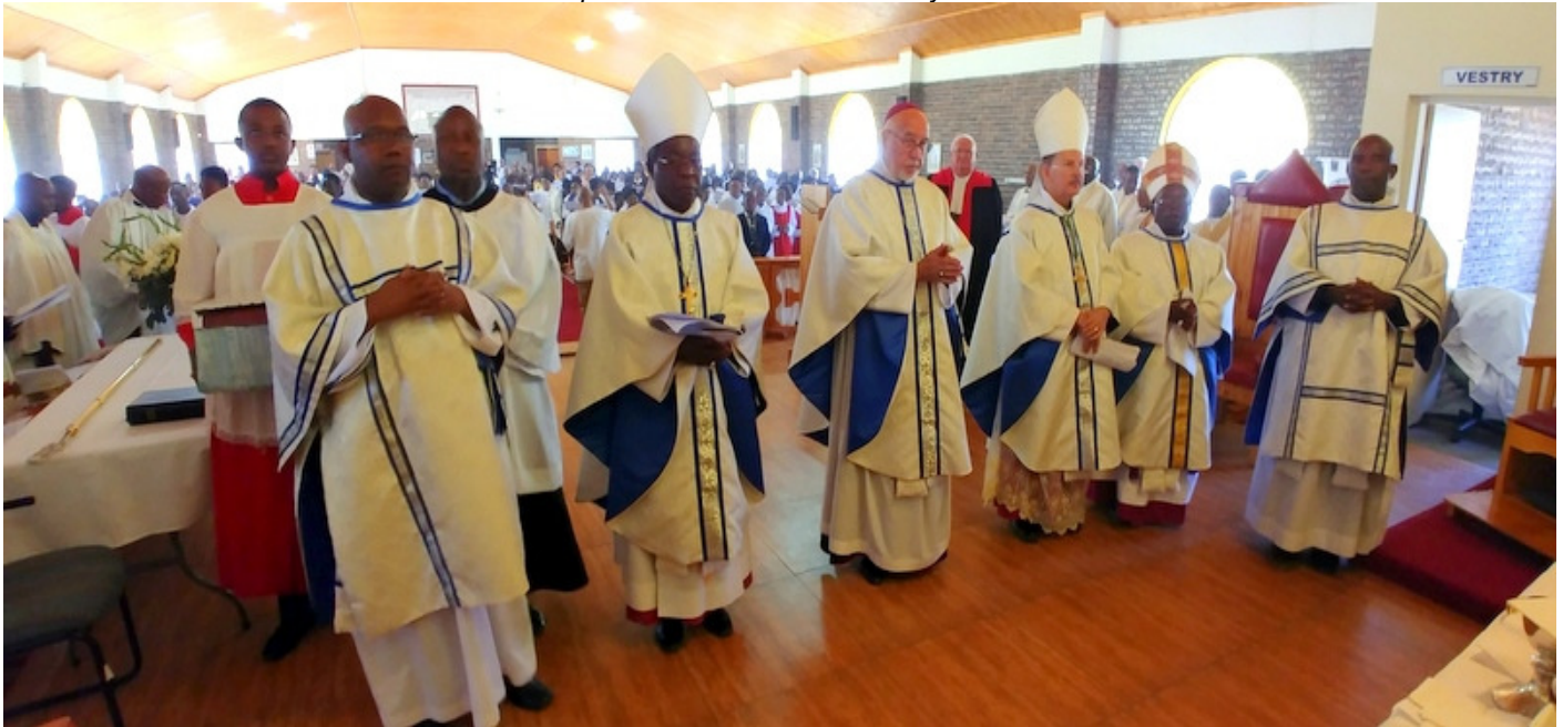
The Bishops come to the Altar for Holy Communion