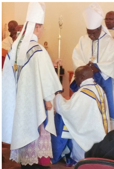
The Ring and Crozier