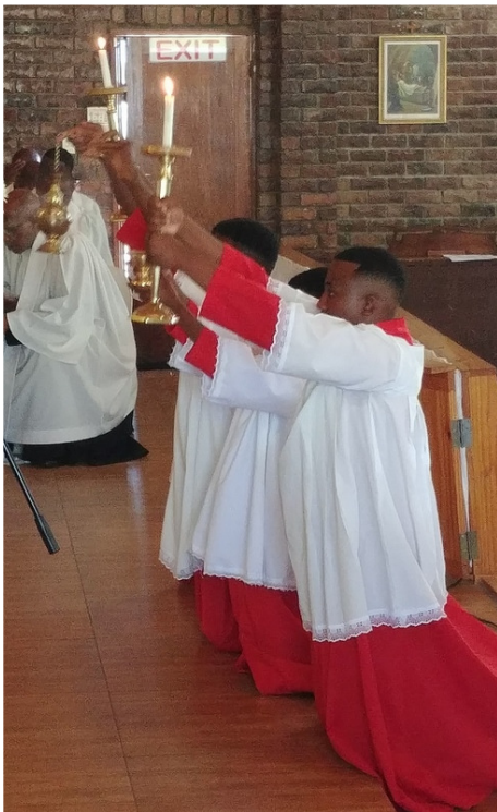
The highly organised servers