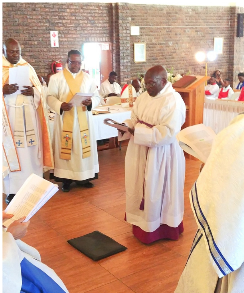
Bishop-Elect Murinda is interrogated by the consecrating Bishops. On either side of him are the four Regional Deans of the Diocese.