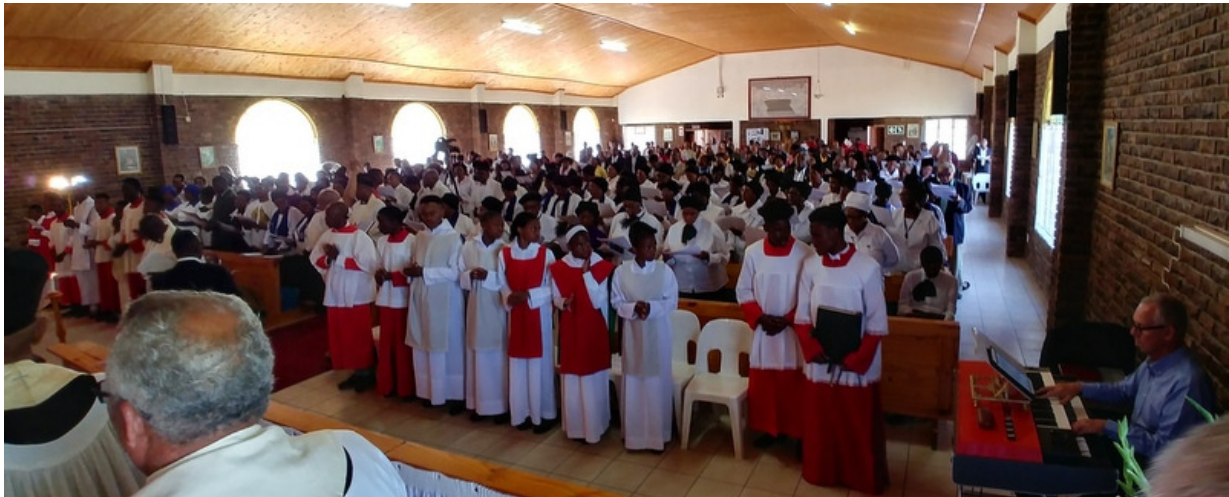
The packed Pro-Cathedral of All Saints, Seshego, Polokwane. An overflow tent outside was needed for all the visitors to the Consecration.