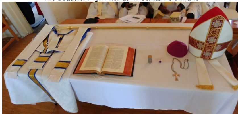
Everything is made ready for Bishop Wellington