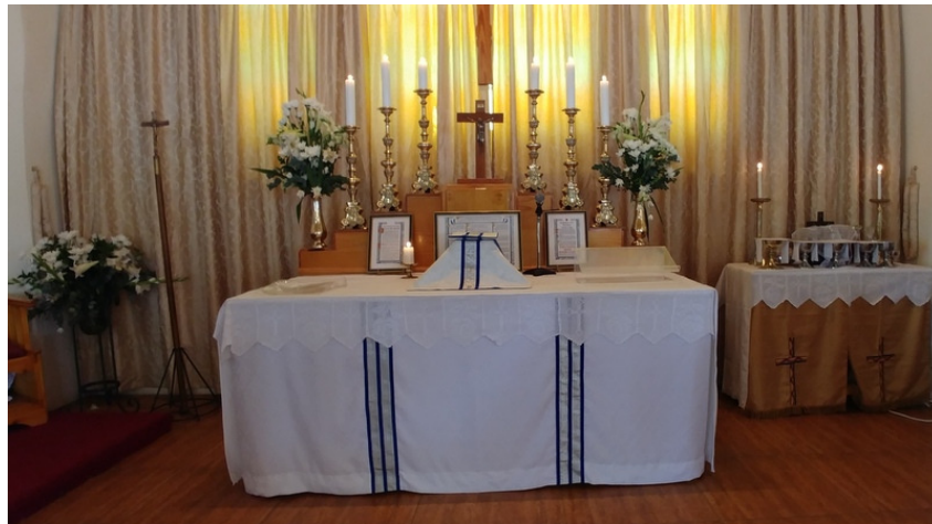
The beautiful High Altar at All Saints Polokwane