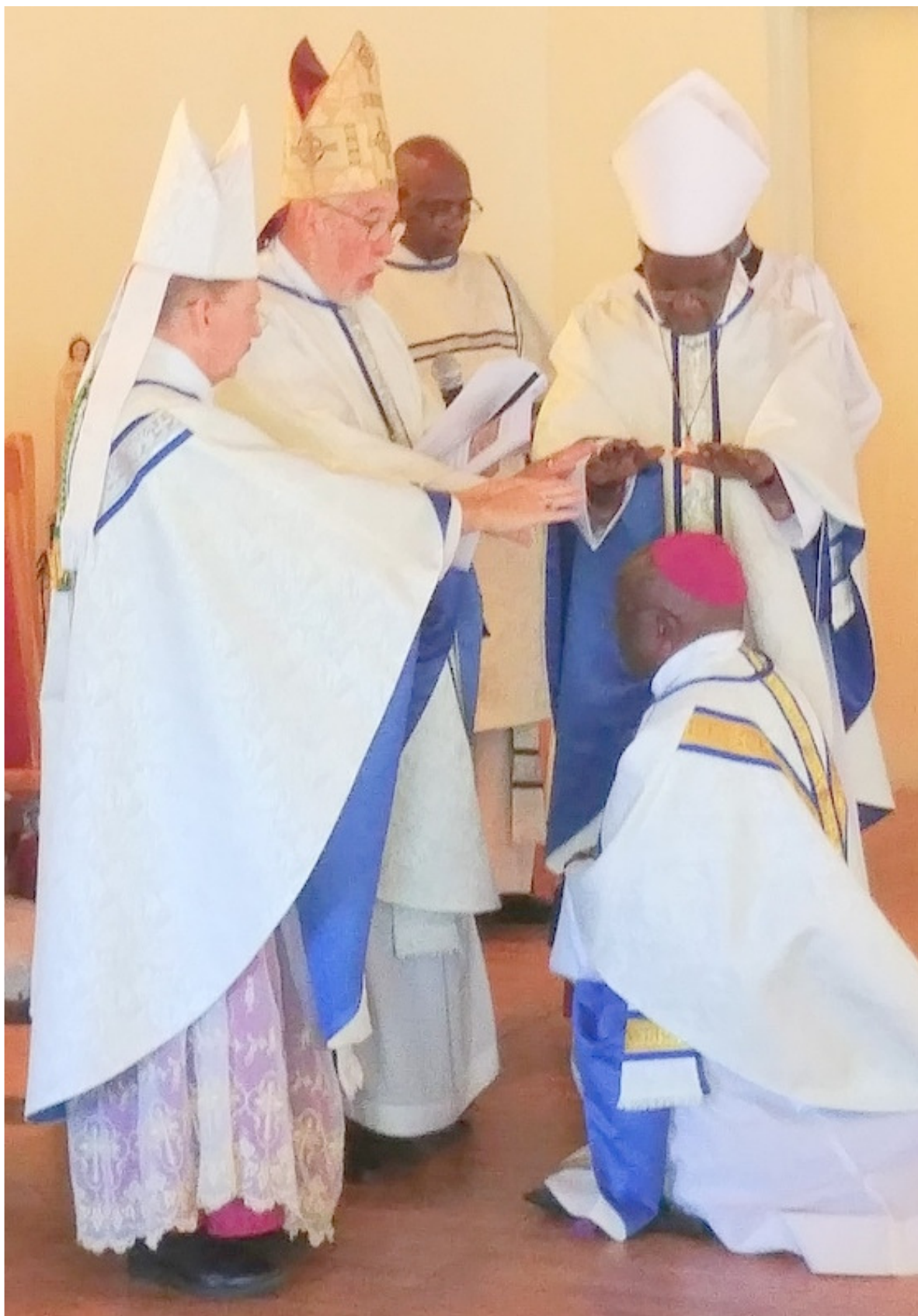
The final blessing prayer