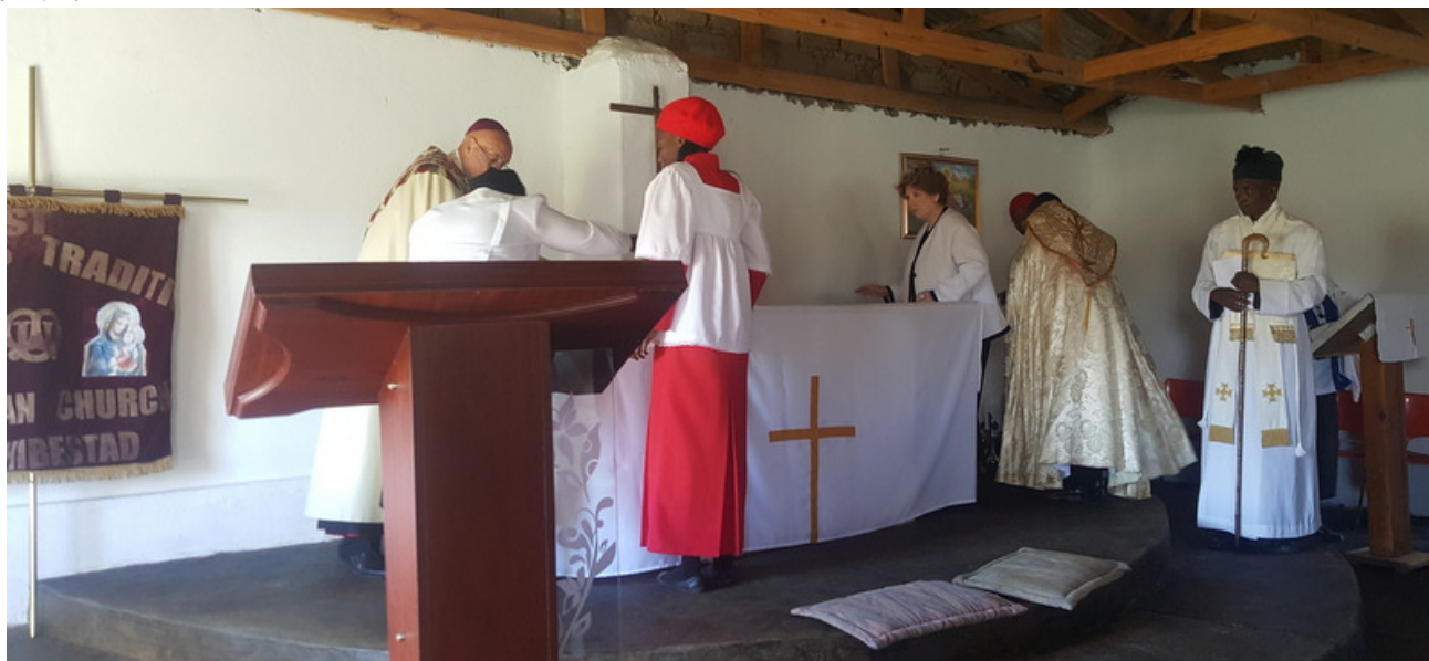
Above - Dressing the newly consecrated Altar.