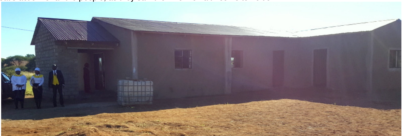
The new church building for St Pater's Parish, Mathibestad – a real work of Faith!

On 30 th April 2017, the Bishop visited the parish to consecrate their new church building. It was a time of great satisfaction for all the people, as they saw their work of faith come to fruition.