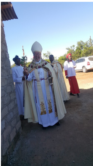
Blessing the outer walls