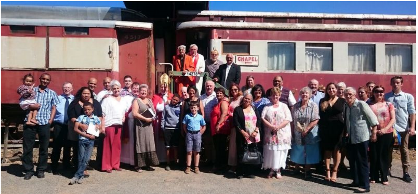
The people of Holy Resurrection, Robertson, Western Cape outside the Gospel Express