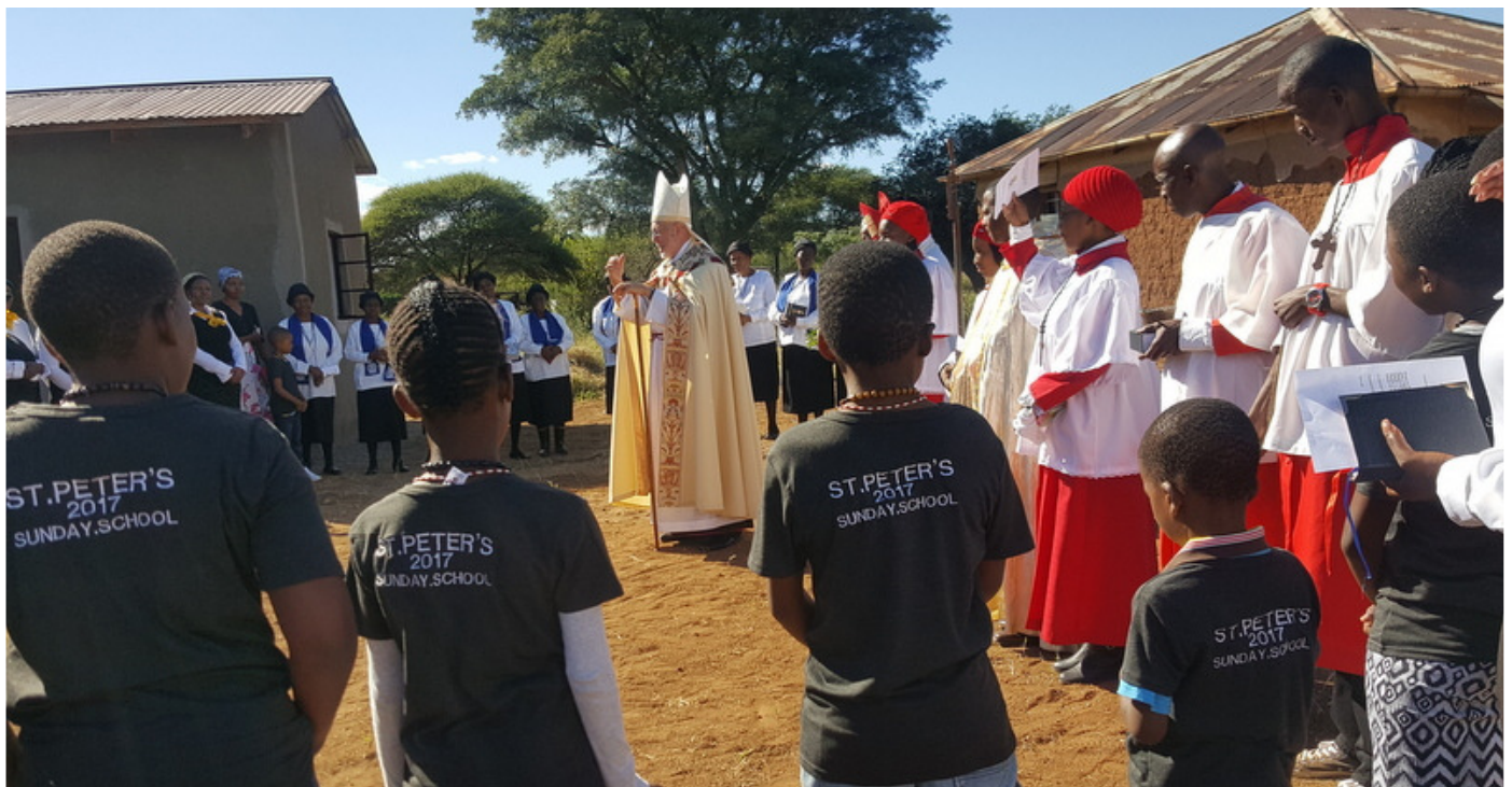
The congregation gather outside the church