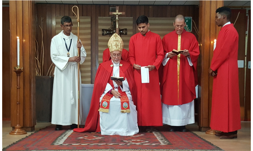
Preparing for Confirmation