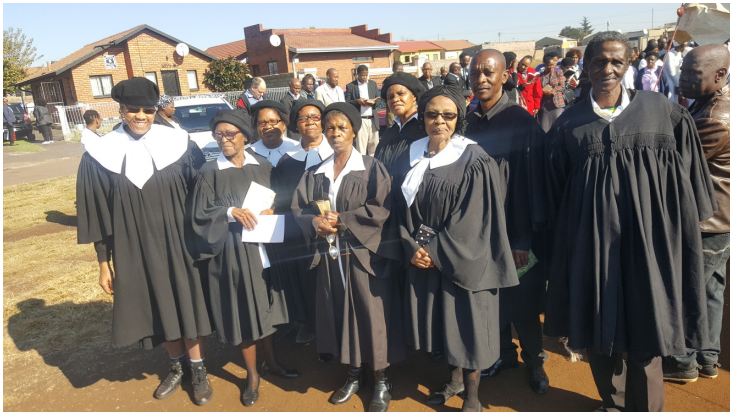
The excellent choir