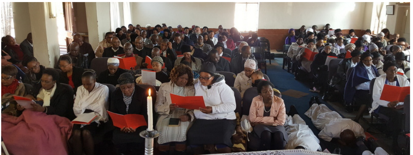
A full house at St Cyprian the Martyr, Atteridgeville.