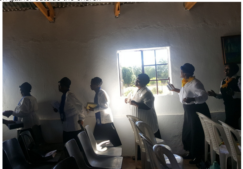
Dancing in praise around the church interior