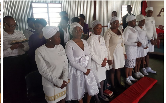
The Candidates for Confirmation