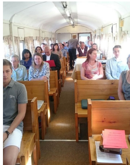
The lovely chapel interior