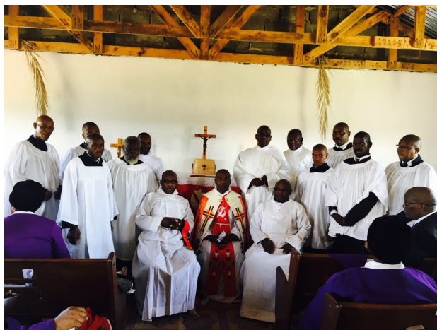
The Altar Party