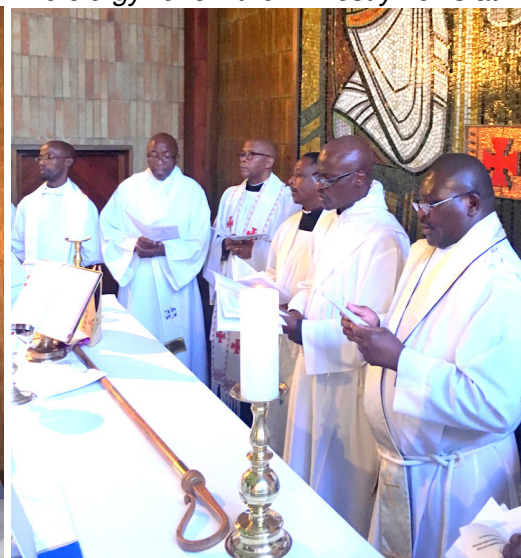
Some of our faithful clergy.