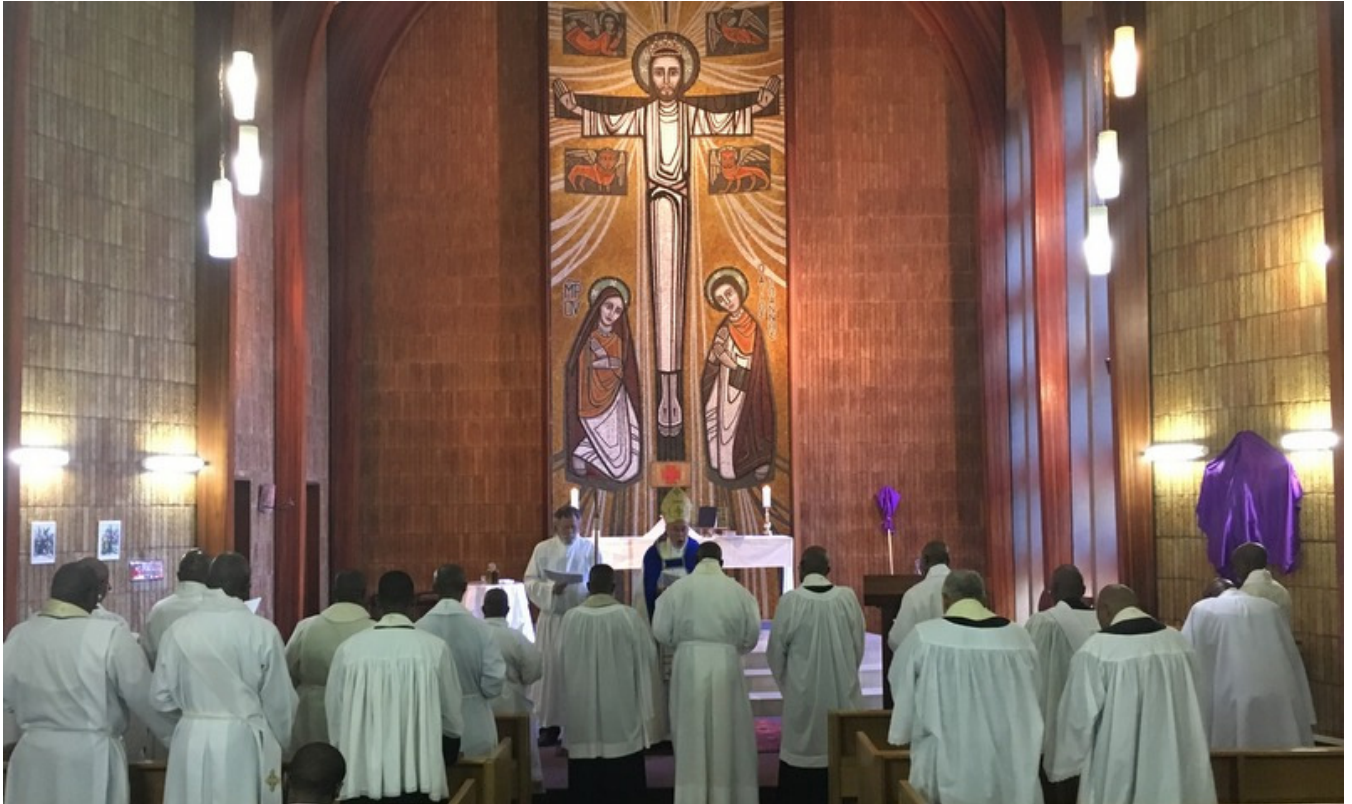
The clergy renew their Priestly vows at Holy Cross.

This beautiful, solemn service took place at the Parish of the Holy Cross, Pretoria. It was well-attended, with some clergy travelling many hundreds of kilometres to join their brethren. A bus strike made it difficult for some of our brethren to attend. Thank you to the clergy from Eastern Cape, Polokwane and Kimberley for their dedication and sense of unity. After the service, all those present gathered for fellowship and lunch at the Bishop's house. It was a wonderful time of unity and focus for the clergy before the serious liturgies of the Passion began to unfold.