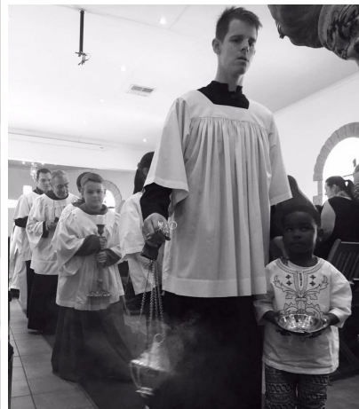
Altar Party at St Andrew's Mondeor