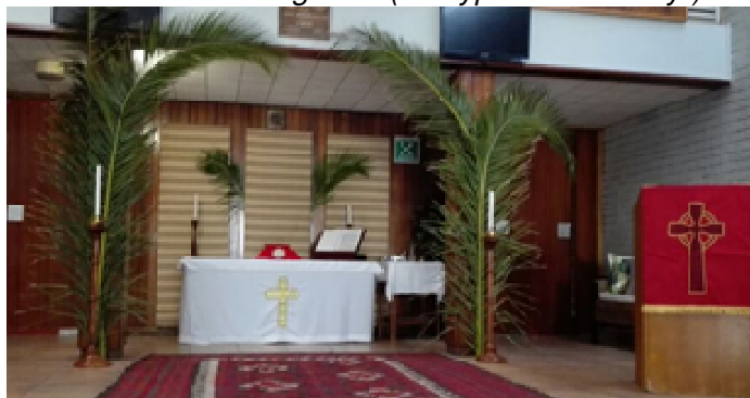
Christ Church, Brackenfell, Cape Town

There are many other images, but this gives you an idea of the dynamic parish activity throughout the Diocese of Southern Africa