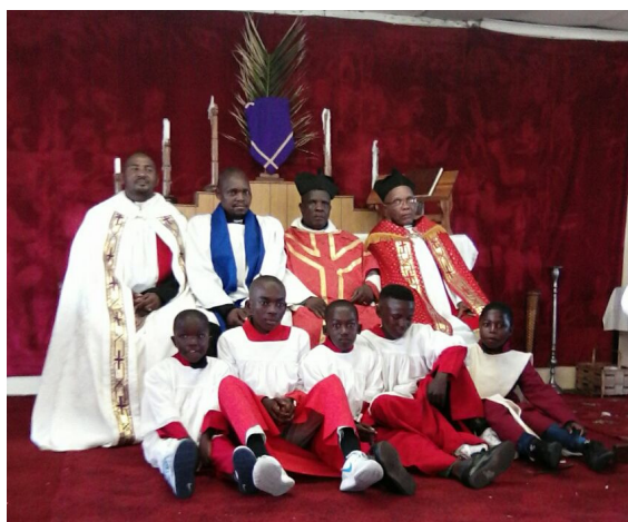
St Mary the Virgin, Port Elizabeth