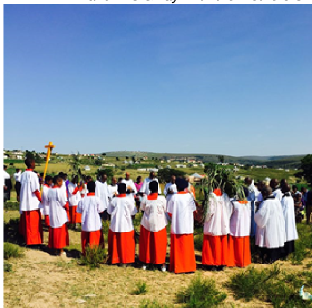
The people of the TAC moving purposefully through the beautiful hills of the Eastern Cape