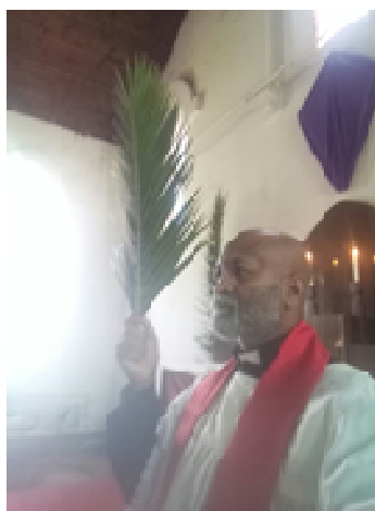
St Mark, Koffiefontein