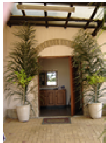
St Andrews Mondeor