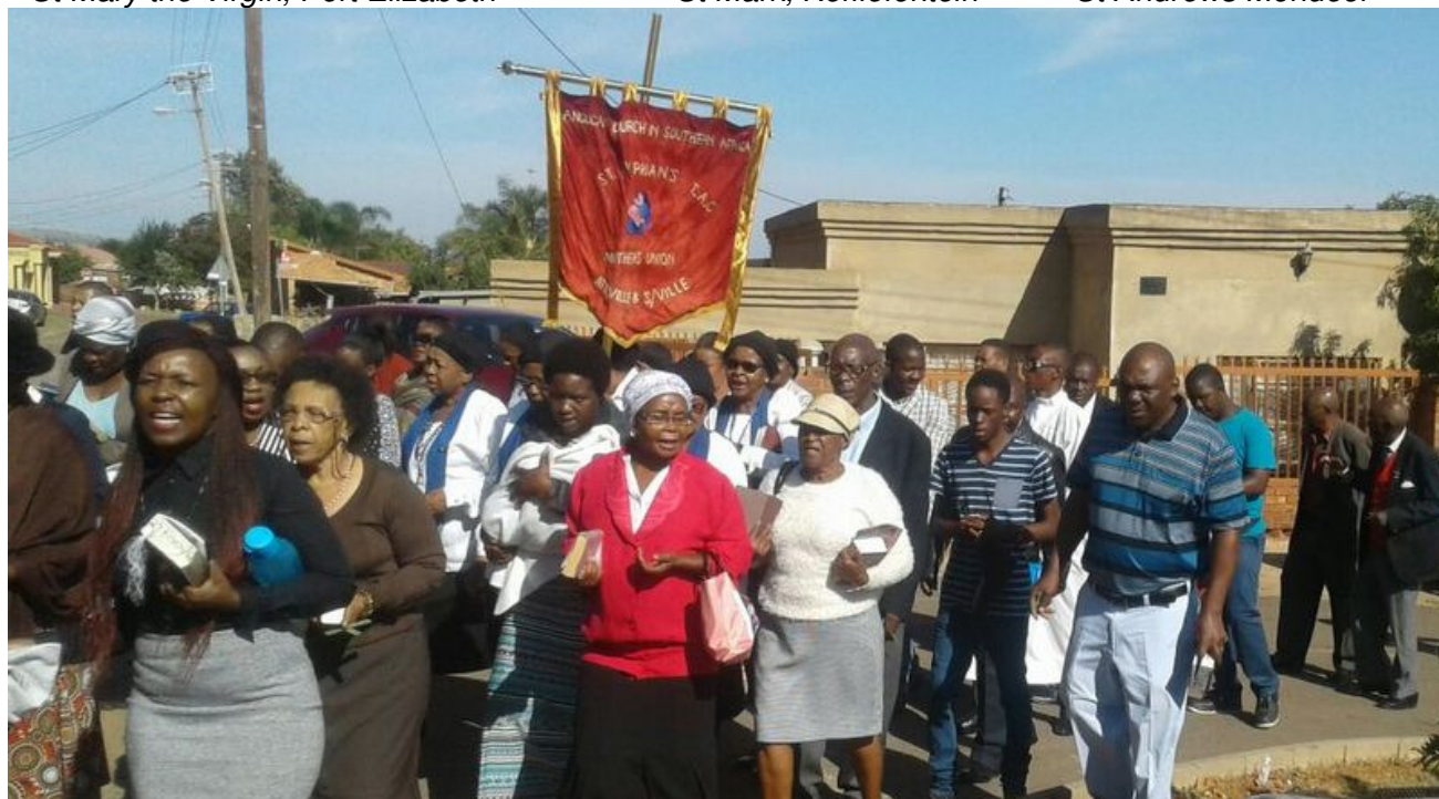
The people of the Traditional Anglican Communion on the move in Atteridgeville (St Cyprian the Martyr)