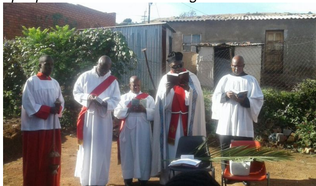
The clergy of St Cyprian's, Atteridgeville