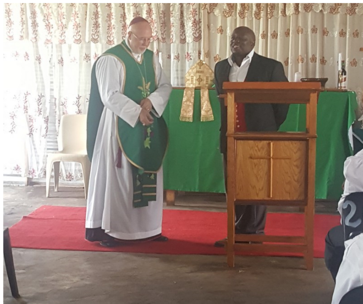
The Bishop presents the Parish with gifts from the Diocese; a carpet and new Lectern, together with chairs, glassware and fresh altar linens.