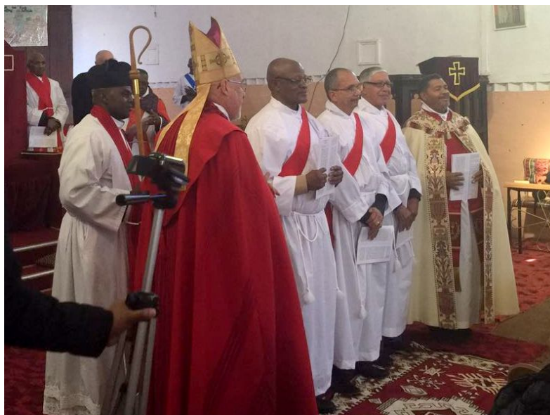
The three Deacons are presented to the Bishop and to the people.