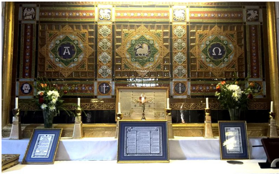
The beautiful High Altar at All Saints, Kimberley. The ceramic tile altarpiece tells the whole story of the Crucifixion in minute detail, and dates from the time when Kimberley was a highly populated diamond mining town.