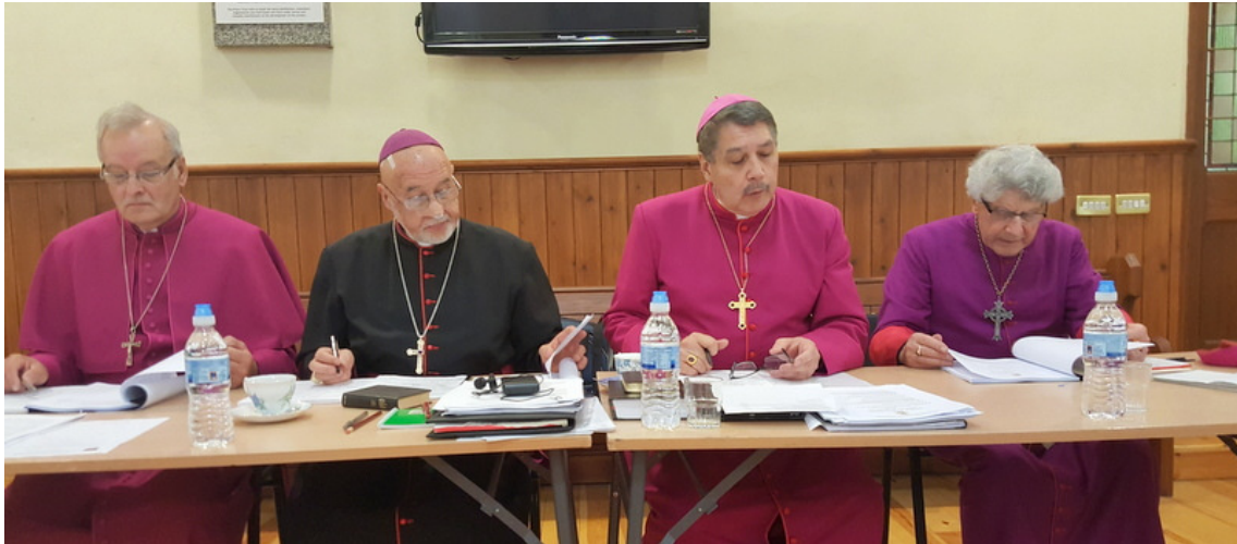
Some pictures of the College of Bishops at work in Lincoln.