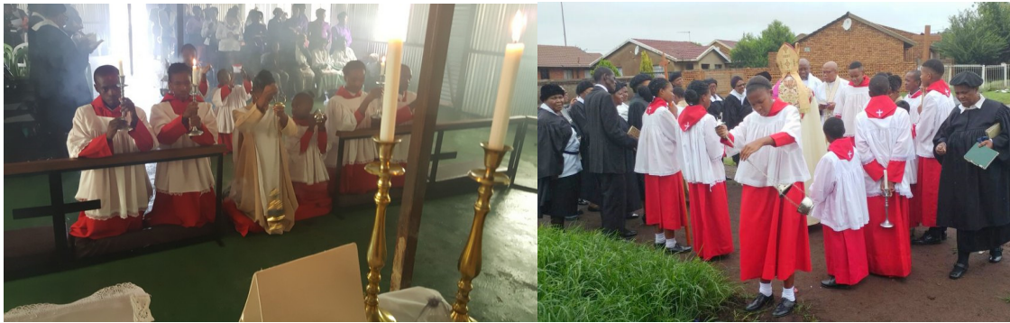
The servers and choir are well prepared and enhance the worship