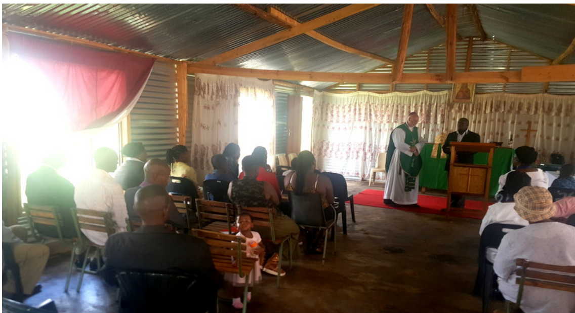
A good sized congregation gather every Sunday at St Martin de Porres.