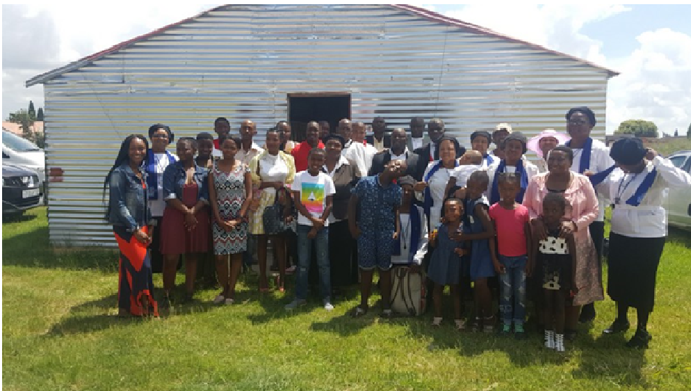
The dedicated people of St Martin de Porres, Ekangala, Mpumalanga Province, outside their new church structure.

We ask that the Holy Spirit may guide and protect us this Lent. Let us pray for each other and all our people, that we may bring glory to Our Lord Jesus Christ by the service of our lives.