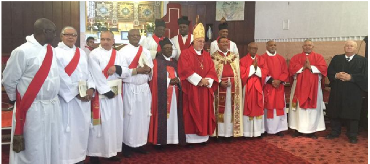
The newly ordained clergy are presented to the people together with their colleagues.